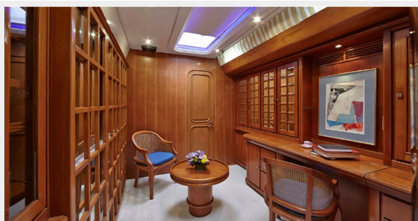
SY Latitude Owner's Office