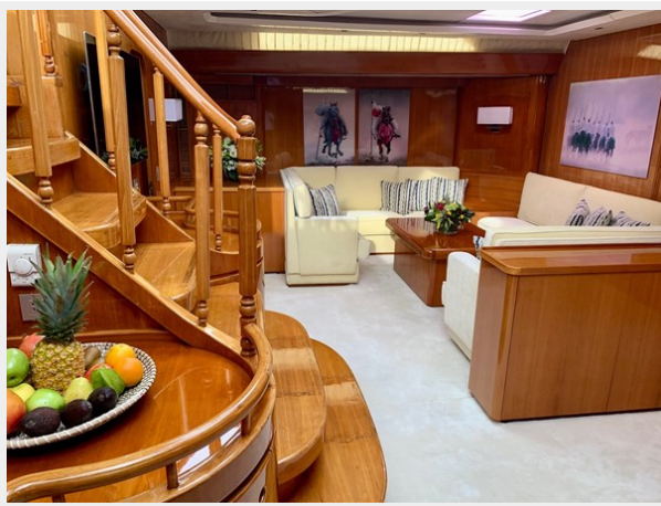
SY Latitude Main Saloon