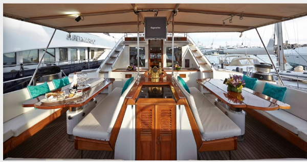
SY Latitude Aft Deck