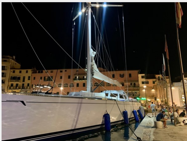
SY Latitude Exterior 7