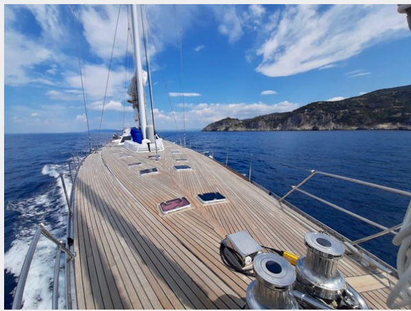
SY Latitude Exterior 5