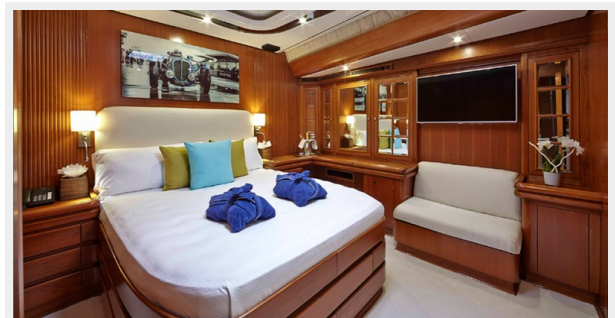
SY Latitude Master cabin