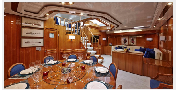
SY Latitude Dining Room 4