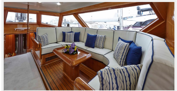
SY Latitude Bridge Deck 2