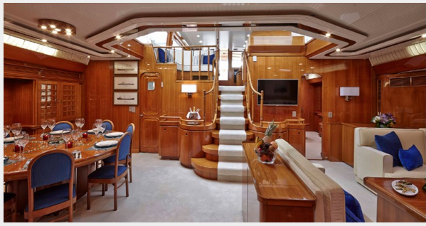
SY Latitude main saloon 4