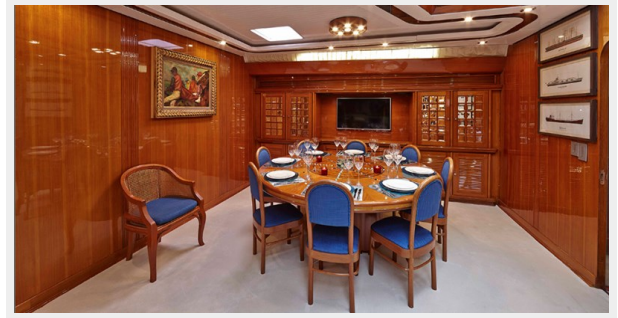
SY Latitude Dining Room 2