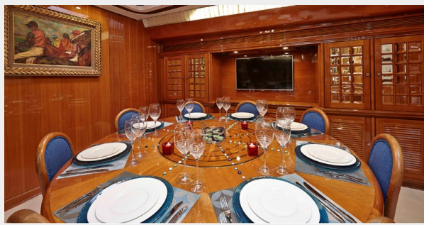
SY Latitude Dining Room 3