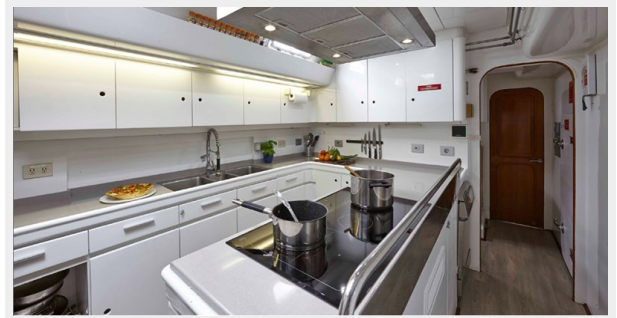
SY Latitude Galley