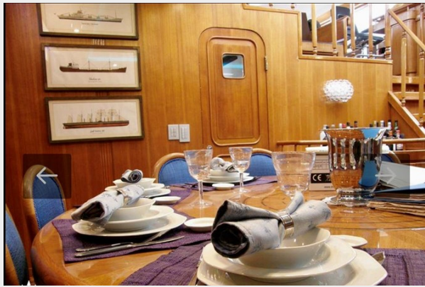
SY Latitude Dining Room