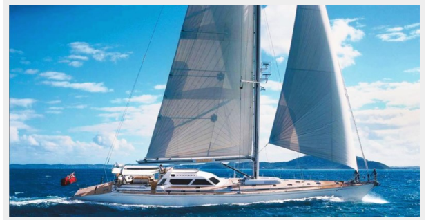
SY Latitude Exterior 6