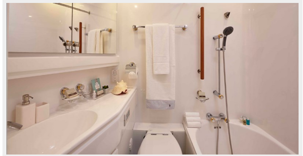
SY Latitude Bathroom 2