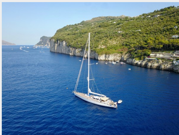
SY Latitude Exterior 2