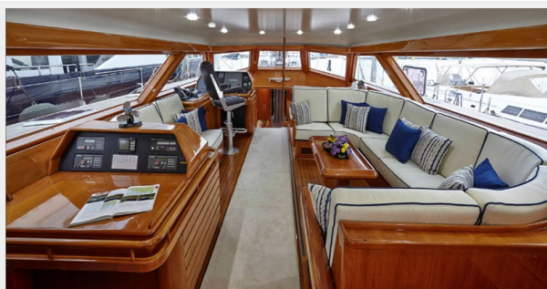
SY Latitude Bridge Deck