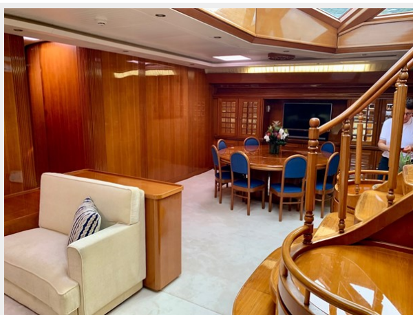
SY Latitude Main Saloon 2