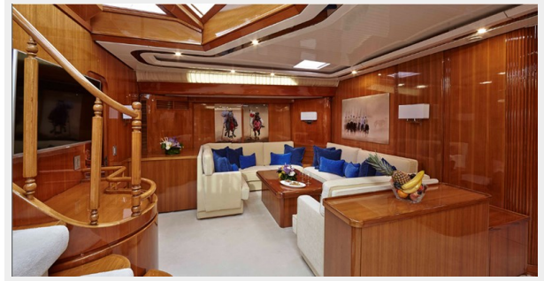
SY Latitude main saloon 5