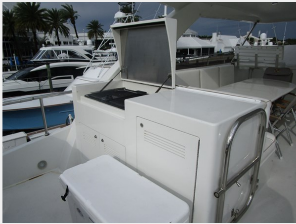
Boat Deck Grill