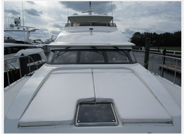
Bow Sun Pad