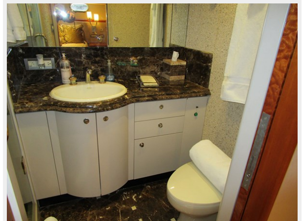
Aft Master Head