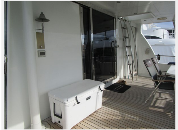
Aft Deck Forward