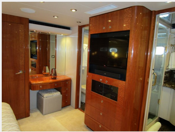
Master Looking to Port