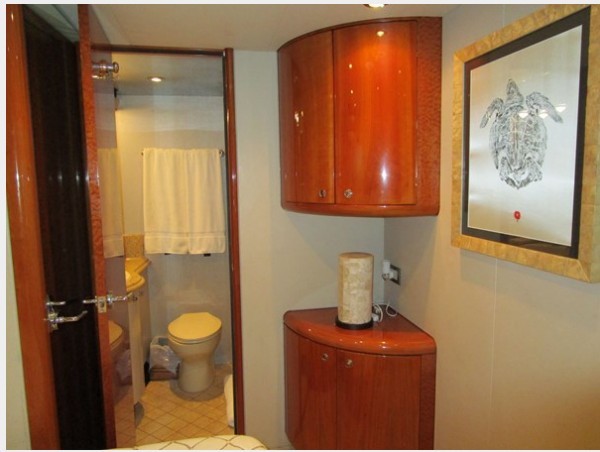
Port Double Cabin