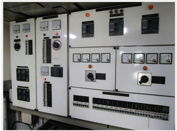
Main Switch Panel