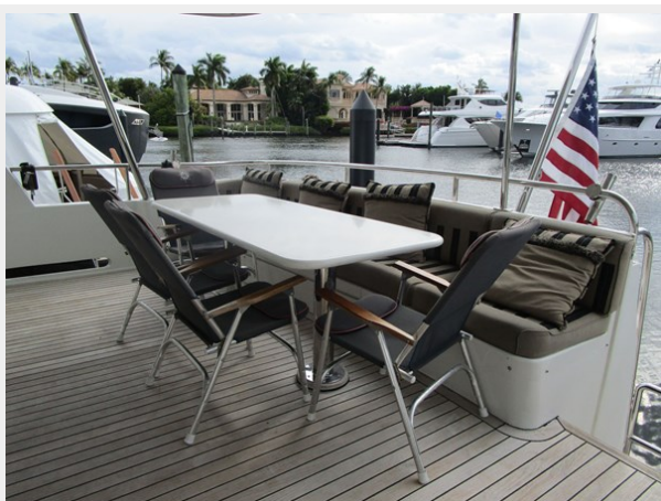
Aft Deck to Starboard