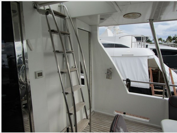
Boat Deck Ladder