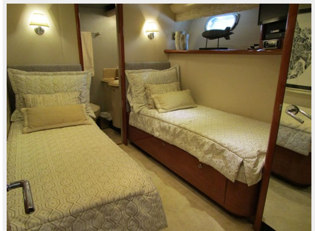
Starboard Twin Cabin