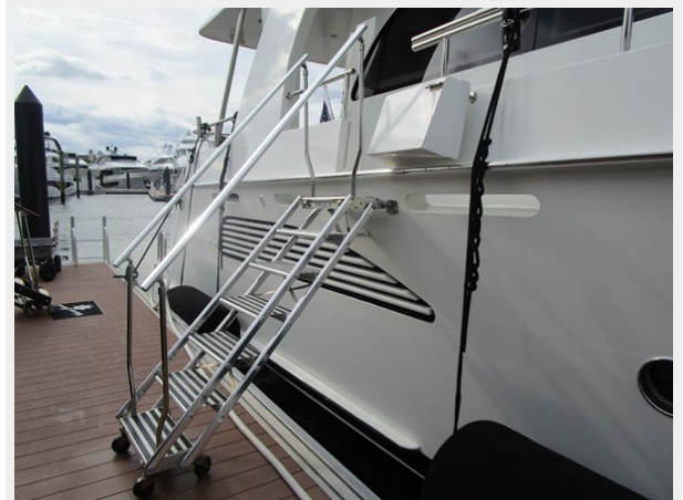
Marquitt Sea Stairs