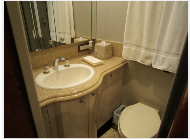
Port Cabin Head