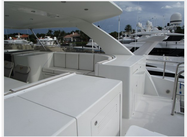
Boat Deck Cabinet