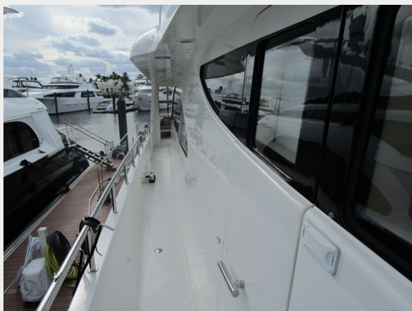
Wide Walk Around Side Decks