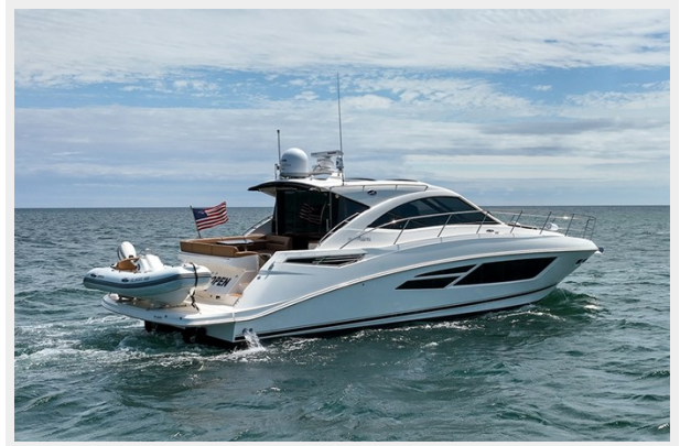
Stbd quarter profile