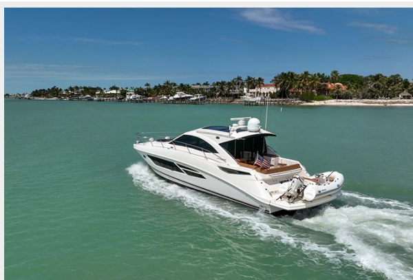
Port quarter profile