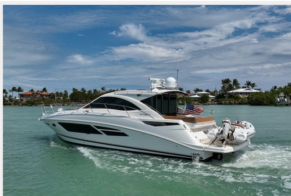
Port quarter profile