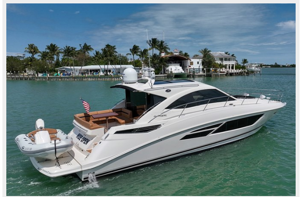
Stbd quarter profile