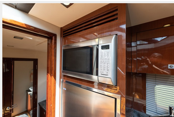
Cuisinart convection microwave oven and grill