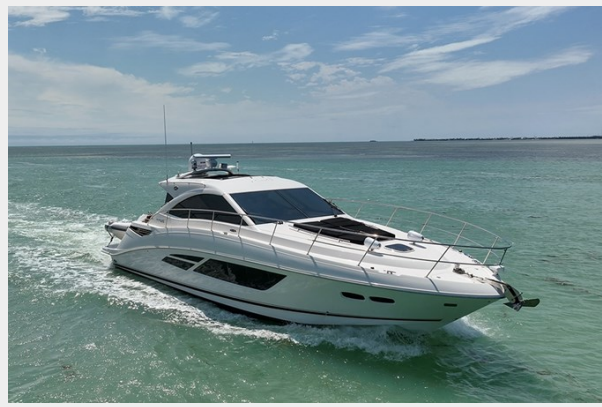
Stbd bow profile