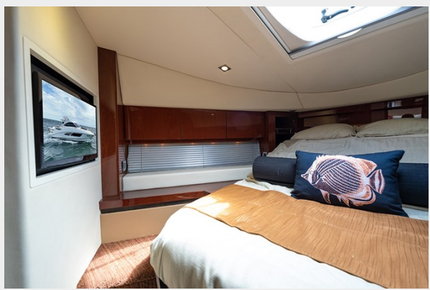
TV in the VIP stateroom