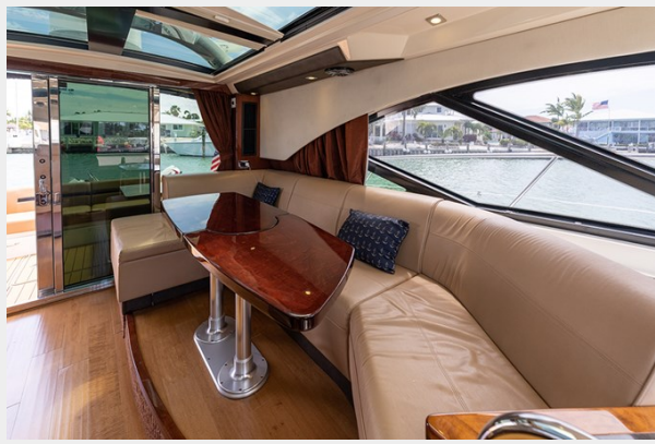
Port upper salon