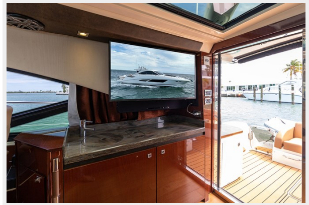
Stbd upper salon