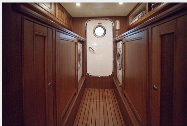
Laundry Area/Engine room access