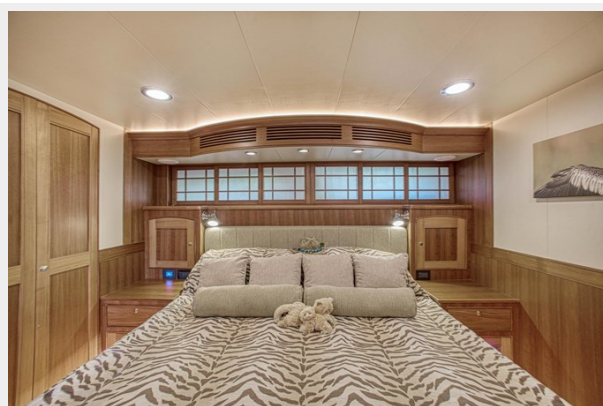
MSR facing Portside