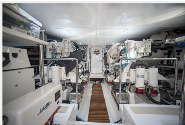
Engine Room facing Forward