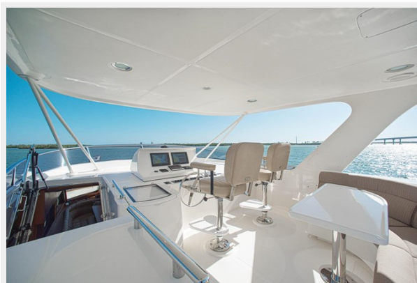
Flybridge facing Forward Starboard