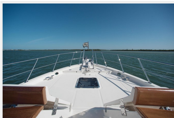
Bow facing Forward