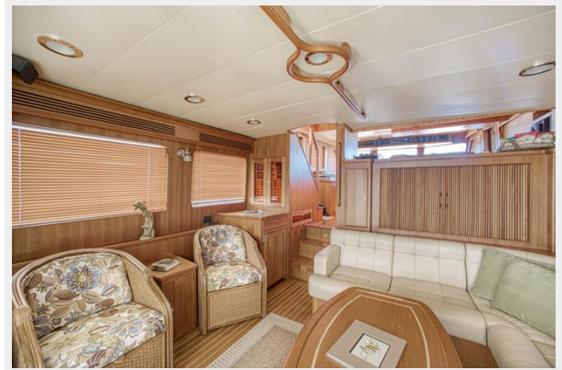
Salon facing Forward Portside