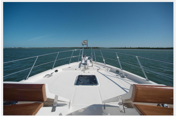
Bow facing Forward