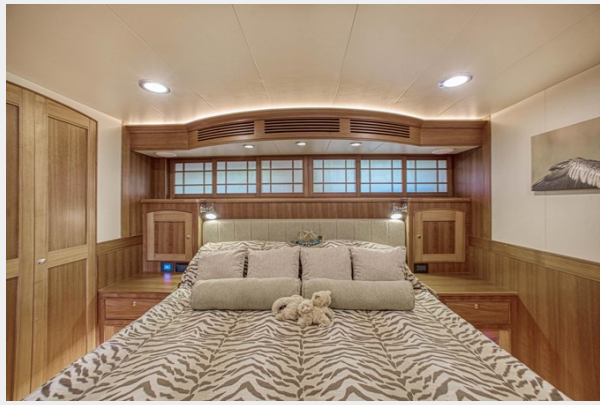
MSR facing Portside