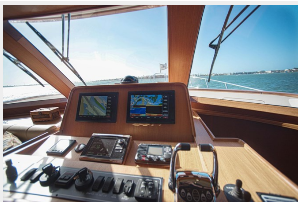
Pilothouse Helm Electronics