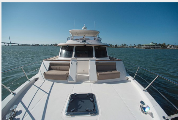
Bow facing Aft