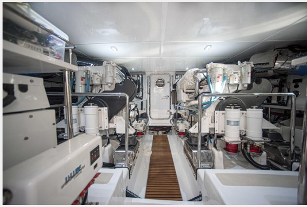
Engine Room facing Forward