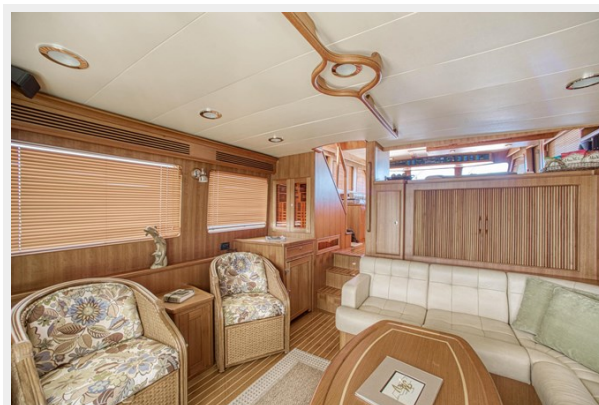
Salon facing Forward Portside