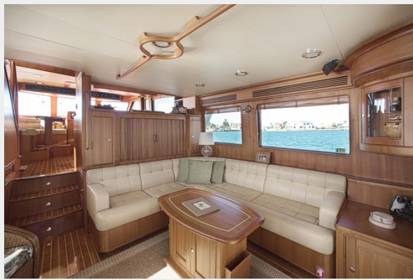
Salon facing Forward Starboard