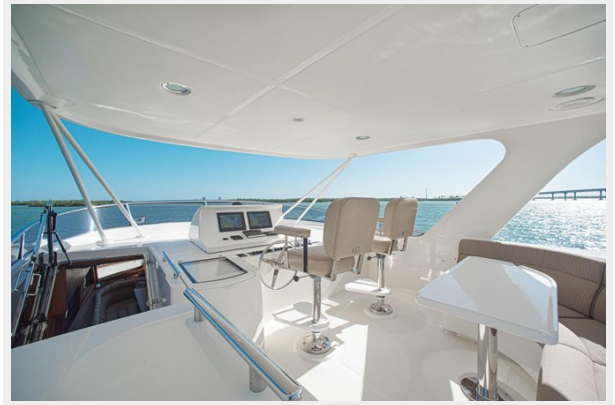
Flybridge facing Forward Starboard