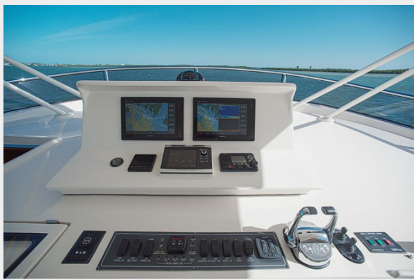
Flybridge Helm Electronics