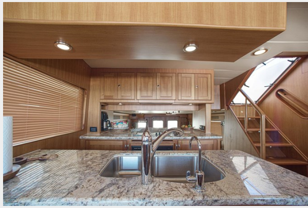
Galley facing Aft