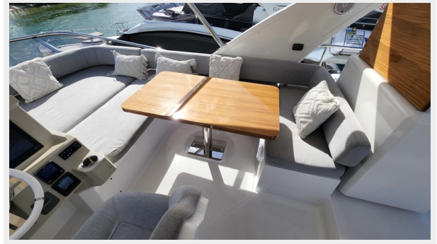
20220707_17.jpg (3) - Copy