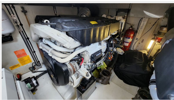
9999 - Copy