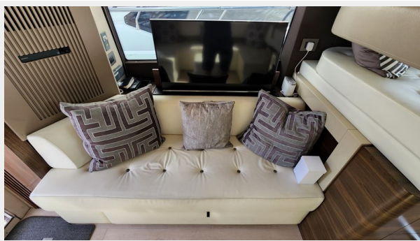
20220707_44 - Copy (2)