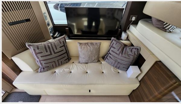
20220707_ - Copy (2)