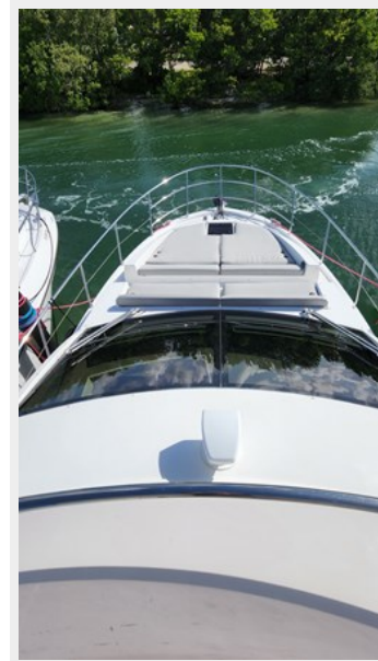
20220707 - Copy (2)