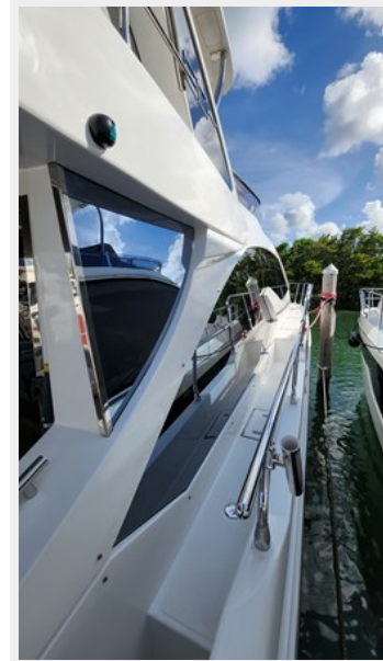
20220707_188 - Copy (2)