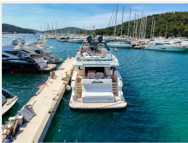
F 960 Familia External 4