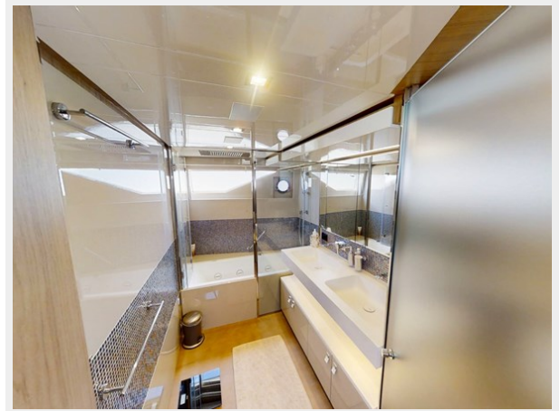
960 Familia Internal 6