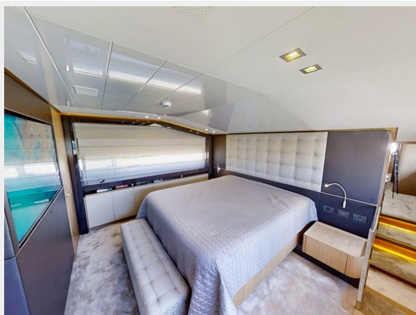
960 Familia Internal 5