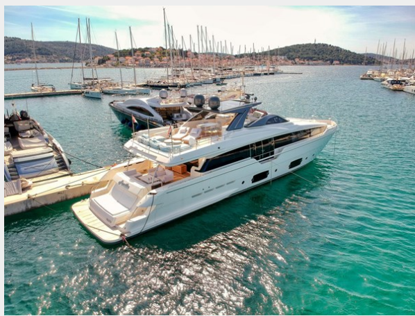
F 960 Familia External 1