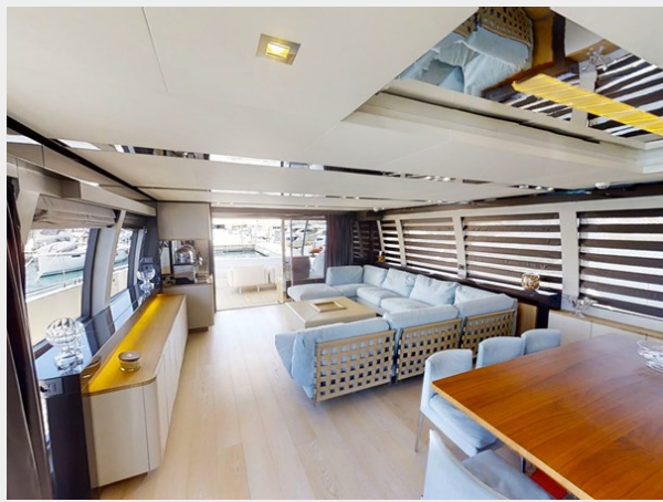
960 Familia Internal 2