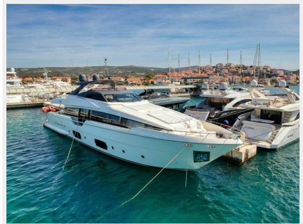
F 960 Familia External 3