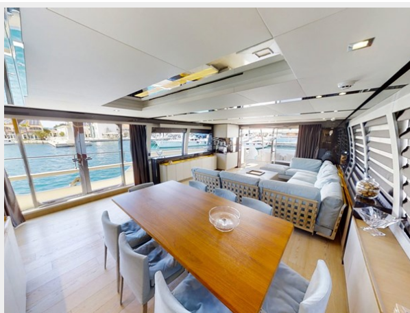
960 Familia Internal 4