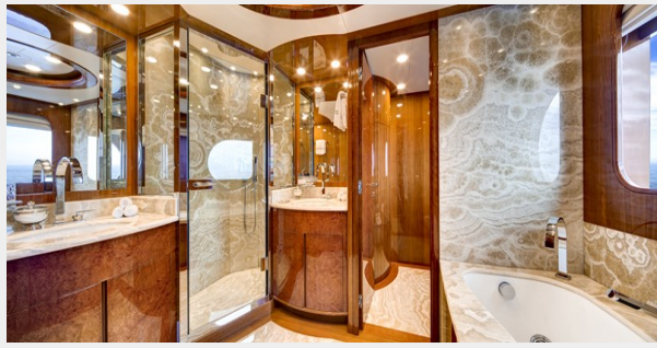
Baron Trenck bathroom5