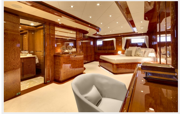
Baron Trenck double