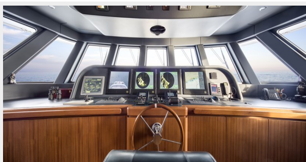
Baron Trenck pilothouse