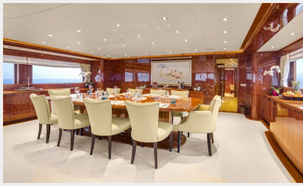
Baron Trenck dining