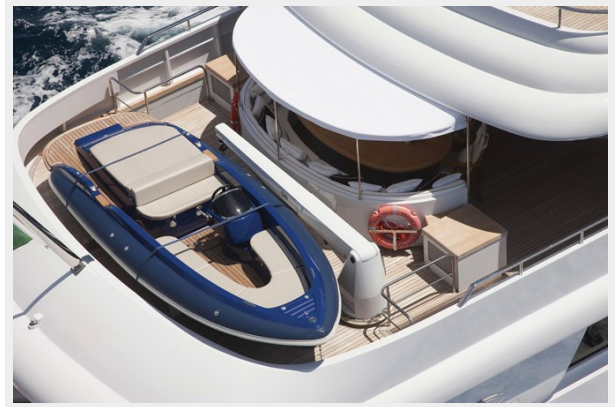
Baron Trenck deck 3