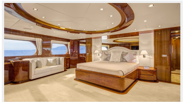
Baron Trenck master