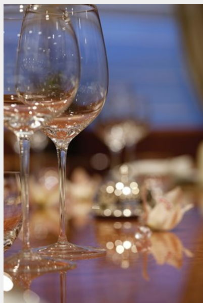
Baron Trenck details3