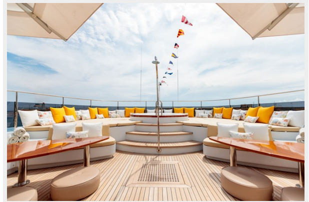
Baron Trenck jacuzzi 6