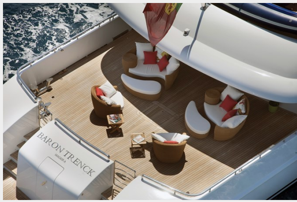
Baron Trenck deck 2