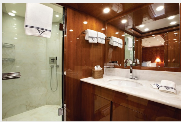
Baron Trenck bathroom 3