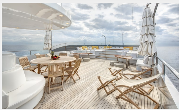
Baron Trenck jacuzzi 1