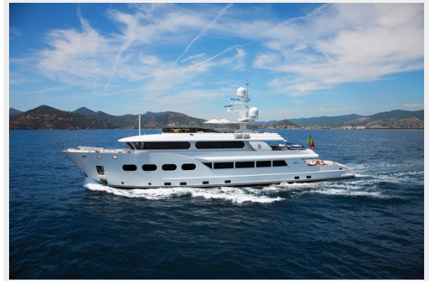
Baron Trenck running 4