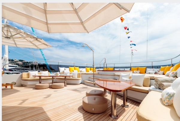
Baron Trenck jacuzzi 7