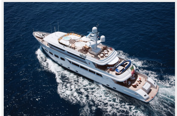
Baron Trenck running 6