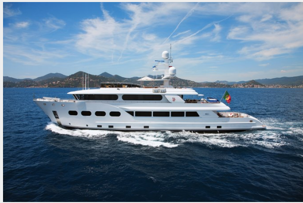
Baron Trenck running 3