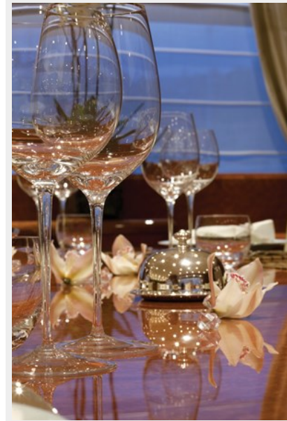
Baron Trenck details2