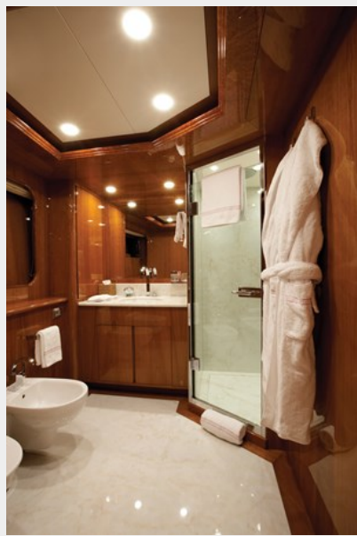
Baron Trenck bathroom 2