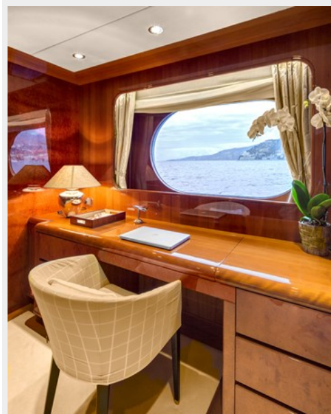
Baron Trenck desk 2