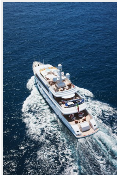
Baron Trenck running 7