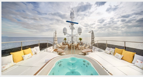
Baron Trenck jacuzzi 5