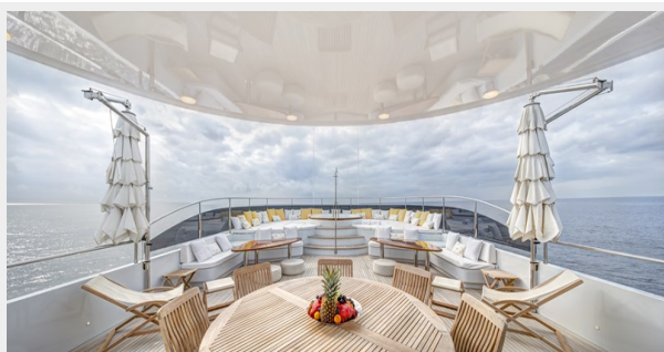
Baron Trenck jacuzzi 3