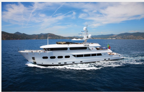
Baron Trenck running 5