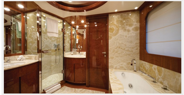
Baron Trenck bathroom 1