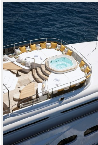
Baron Trenck deck 1