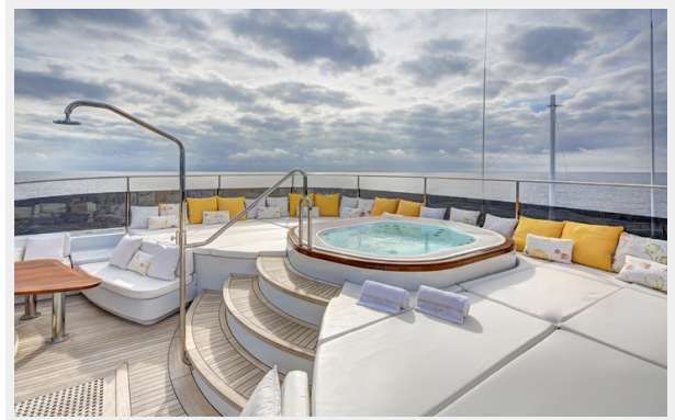
Baron Trenck jacuzzi 2