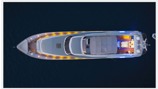
Anavi aerial view