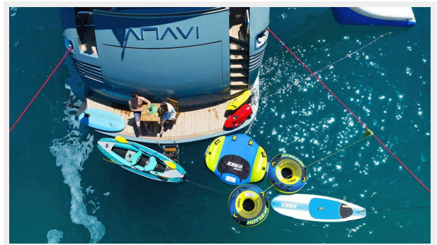
Anavi swim platform