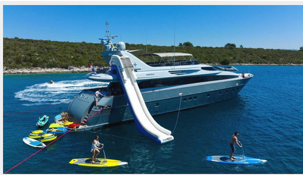
Anavi water toys