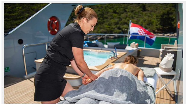
Anavi flybridge massage