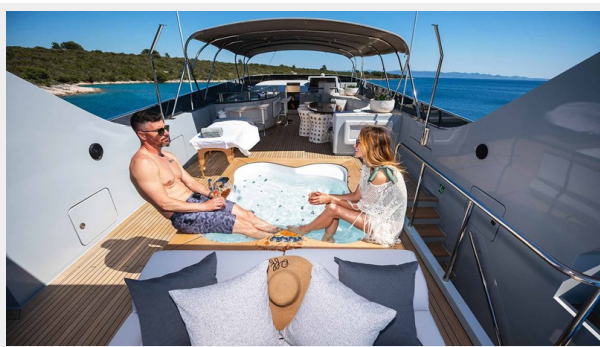
Anavi flybridge jacuzzi