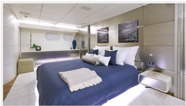
Anavi Master cabin