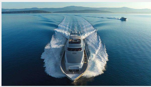
Anavi front view