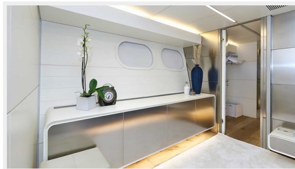
Anavi Master cabin detail