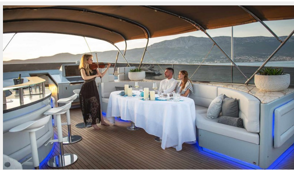
Anavi flybridge dining area