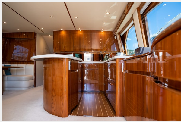
MY Tia Saloon 3