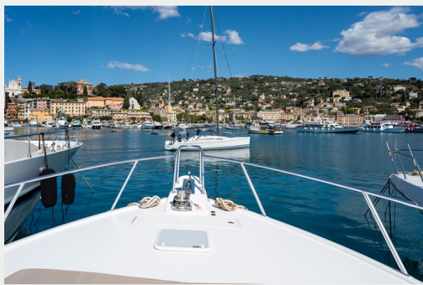
MY TIA exterior 8