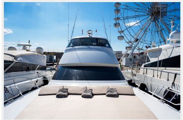
MY TIA exterior 7