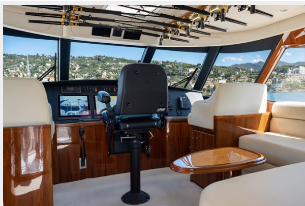
MY Tia cockpit 2