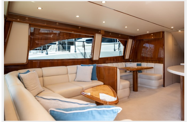
MY Tia Saloon 2