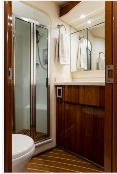
MY Tia Bathroom 2