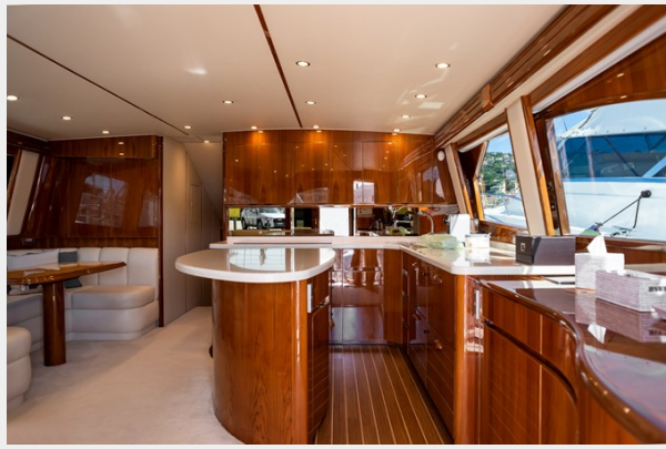
MY Tia Saloon 1