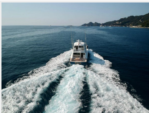
MY Tia Cruising 4