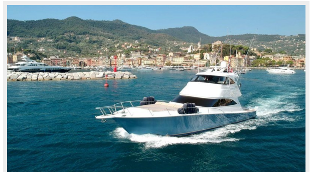
MY Tia Cruising 1