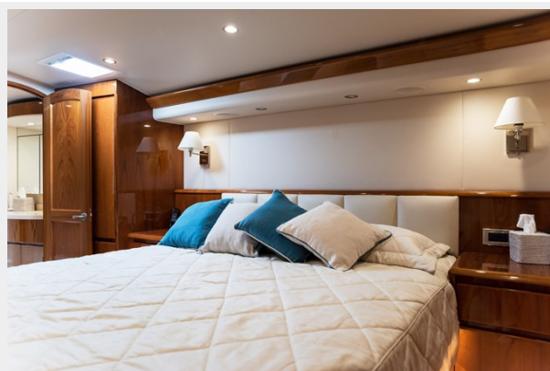
MY Tia Master Room 3