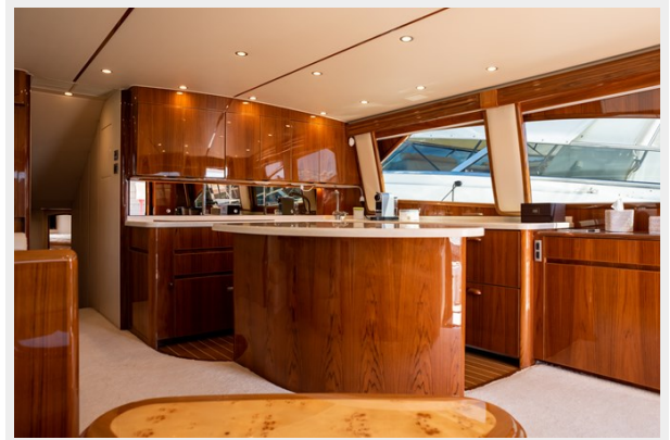
MY Tia Saloon 4