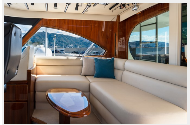
MY TIA cockpit 1