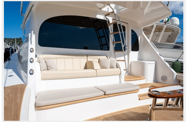
MY TIA exterior 1