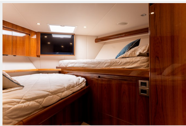
MY Tia Cabin 2