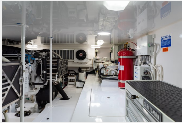
MY TIA engine room 2