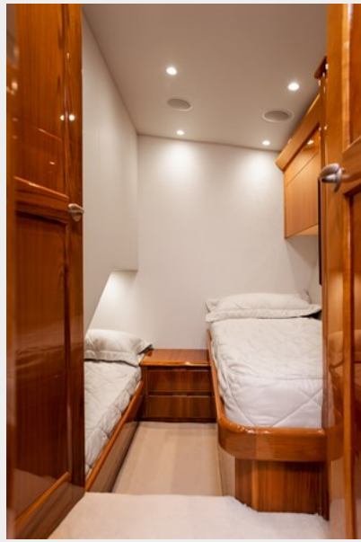
MY Tia Cabin 4