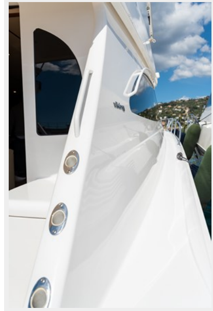
MY TIA exterior 13