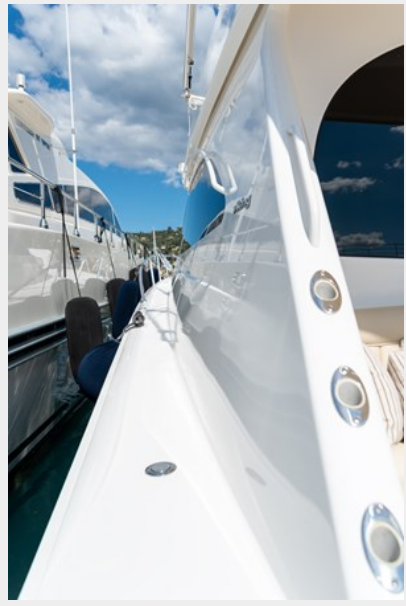
MY TIA exterior 12