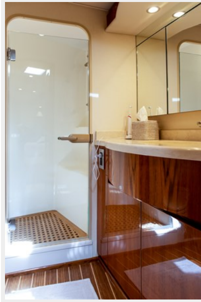
My Tia Bathroom 1