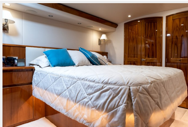
MY Tia Master Room 1