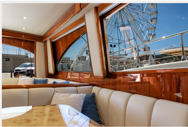
MY Tia Saloon 5