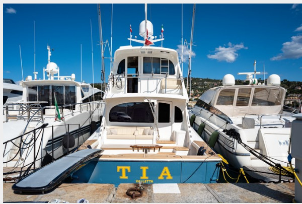
MY TIA exterior 4