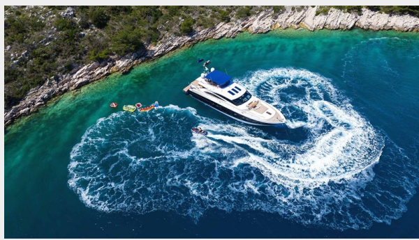
Agave aerial water toys