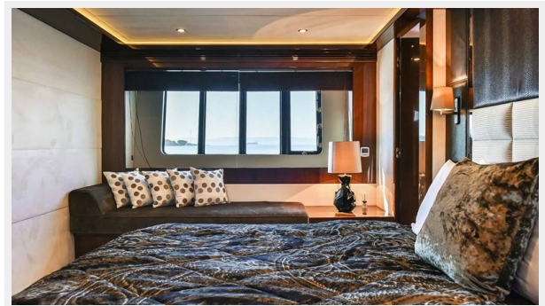
Agave double cabin view