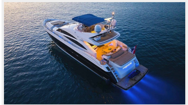
Agave aft view