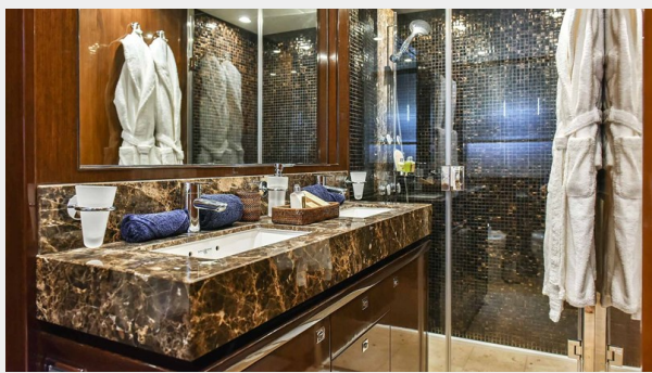
Agave double cabin head