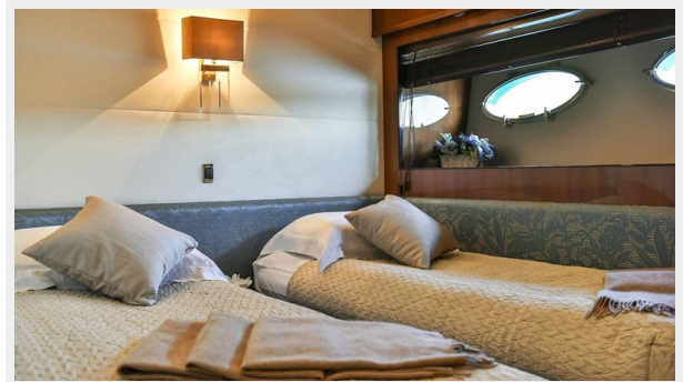
Agave convertible cabin