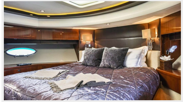
Agave double cabin aft