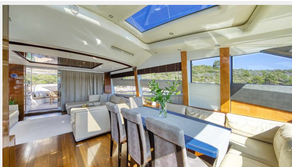
Agave salon view