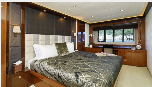
Agave double cabin