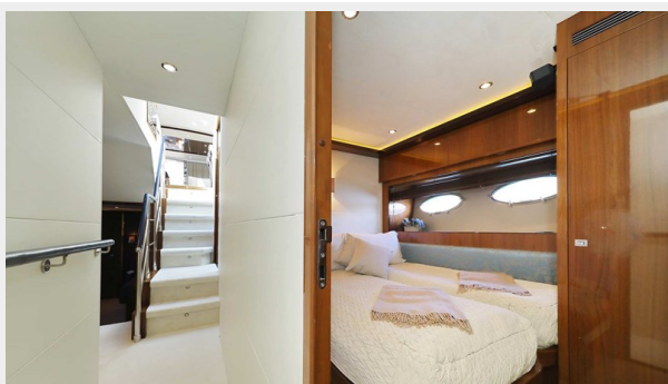
Agave convertible cabin view