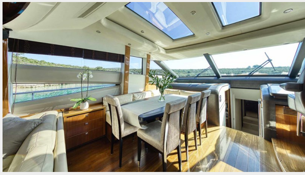
Agave dining area