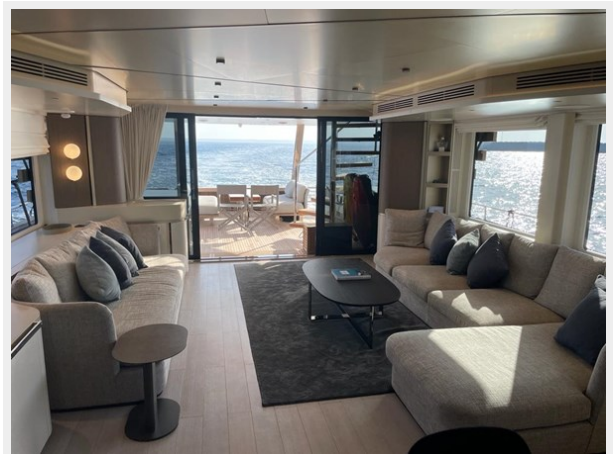
SALOON & COCKPIT - MAGELLANO 25 2023