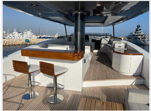
FLYBRIDGE - MAGELLANO 25 2023