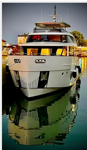
bow - MAGELLANO 25 2023