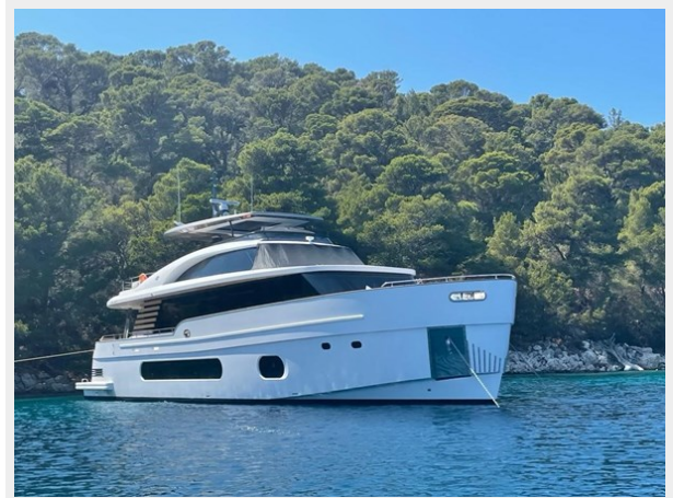
STARBOARD - MAGELLANO 25 2023