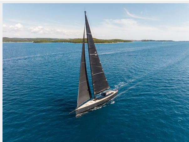
Whimsea aerial (24 de 38)