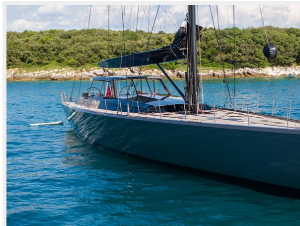
Whimsea aerial (25 de 38)