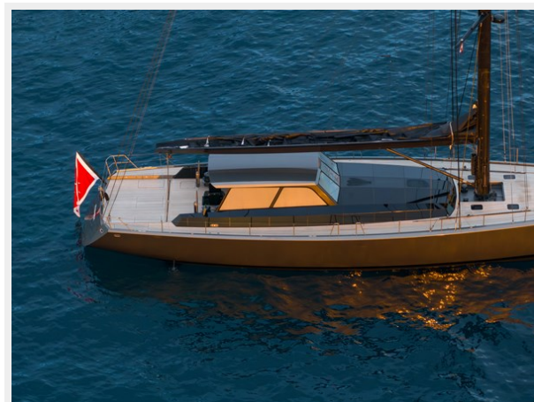
Whimsea aerial (11 de 38)