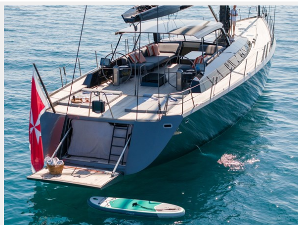
Whimsea aerial (26 de 38)