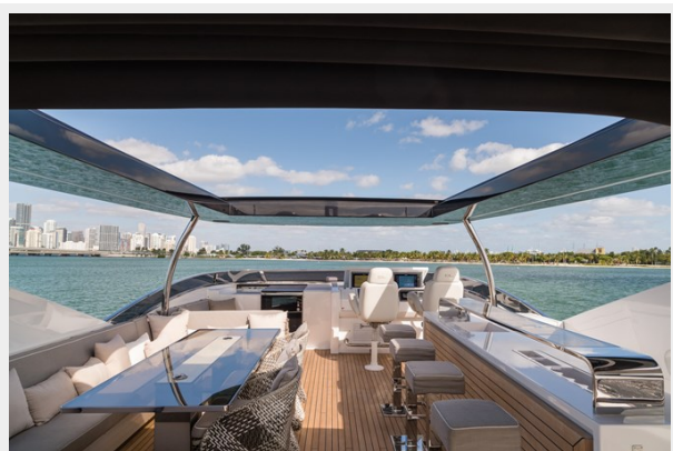
Flybridge Bar & Dining