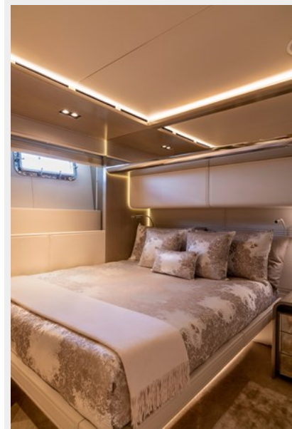
Queen Bed Suite