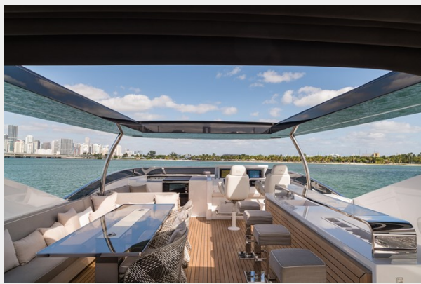
Flybridge Bar & Dining