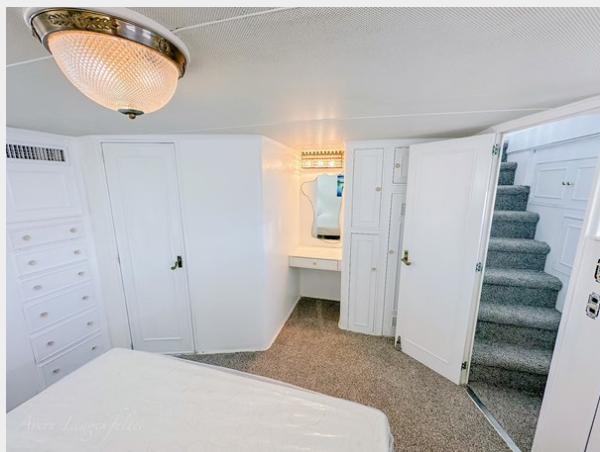
016 Master - Stairs