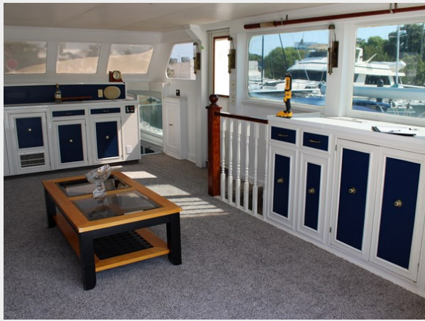
012 Main Salon