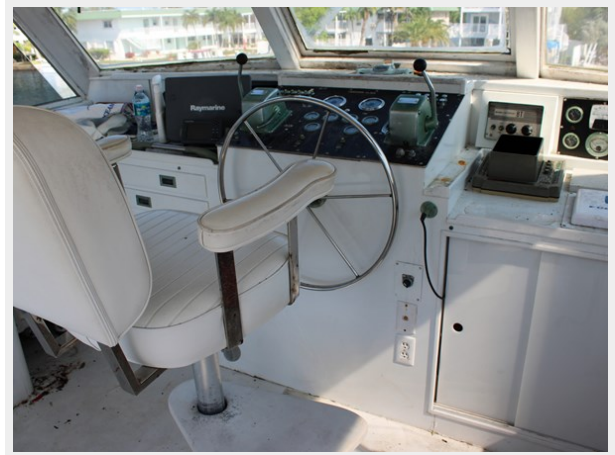
031 Fly Bridge