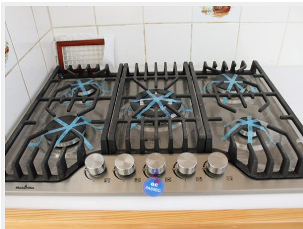
012 Galley - Range