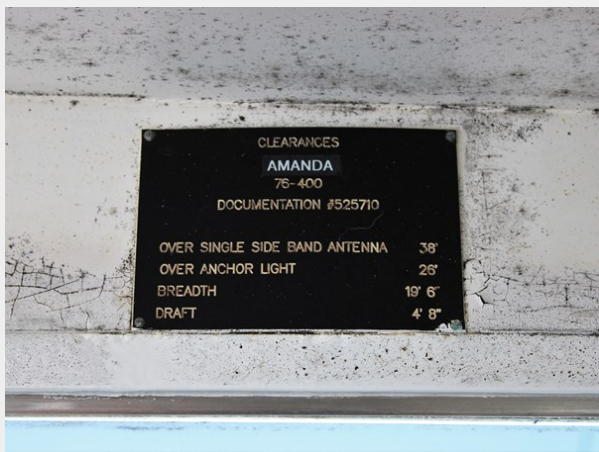
036 Fly Bridge