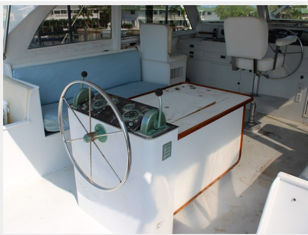
032 Fly Bridge