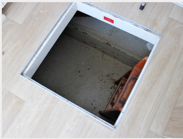
030 Galley - Storage