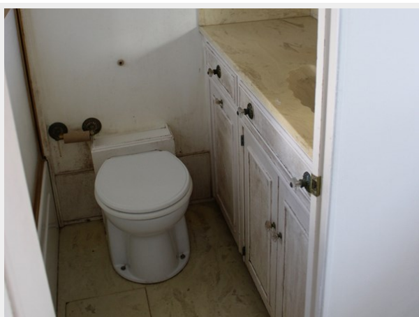
017 Master Head