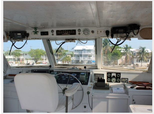
030 Fly Bridge