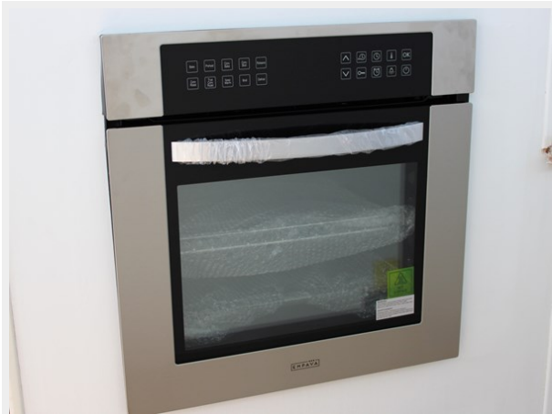
010 Galley - Oven