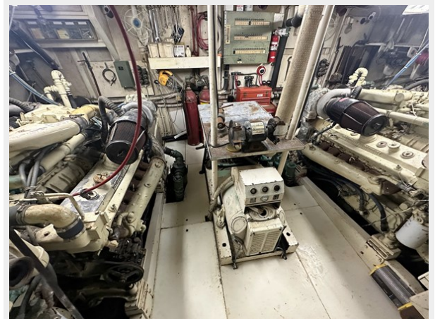
037 Engine Room