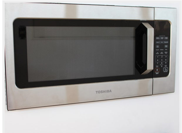
011 Galley - Microwave