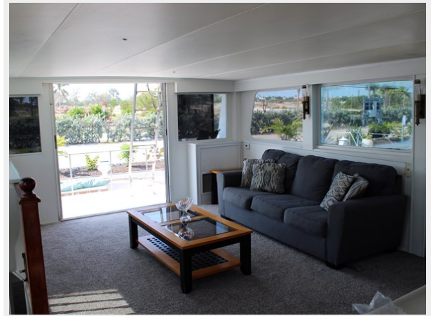
013 Main Salon