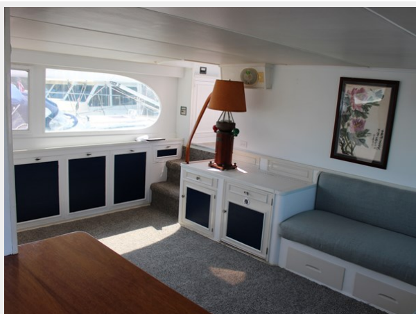
020 Lower Salon-Dining