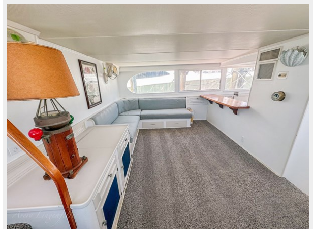
017 Lower Salon-Dining