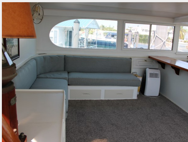
018 Lower Salon-Dining