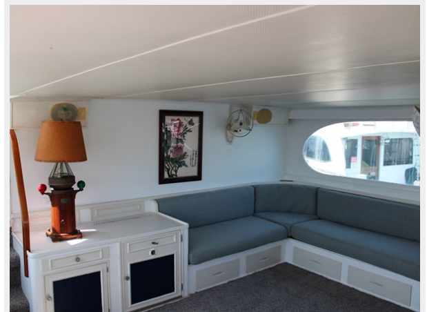
019 Lower Salon-Dining