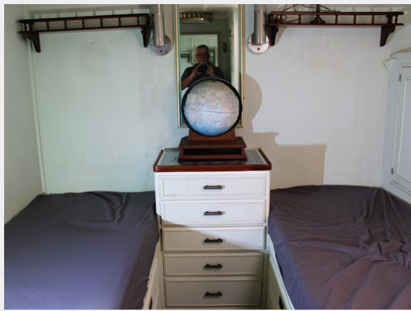
044 Guest Stateroom