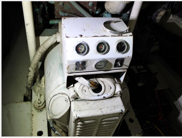
040 Generator 1