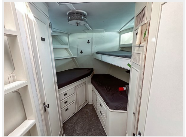
046 Guest 2 - Crew