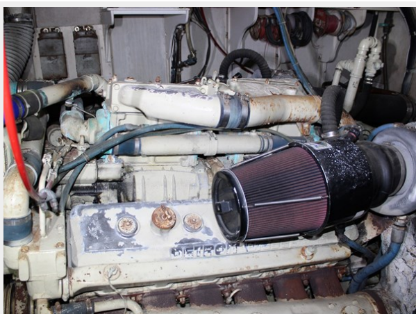
038 Port Main