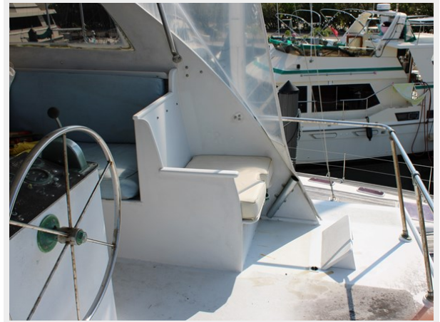
035 Fly Bridge