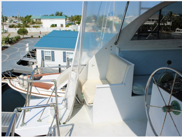
034 Fly Bridge