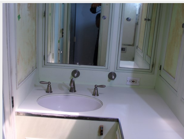
045 Guest Head