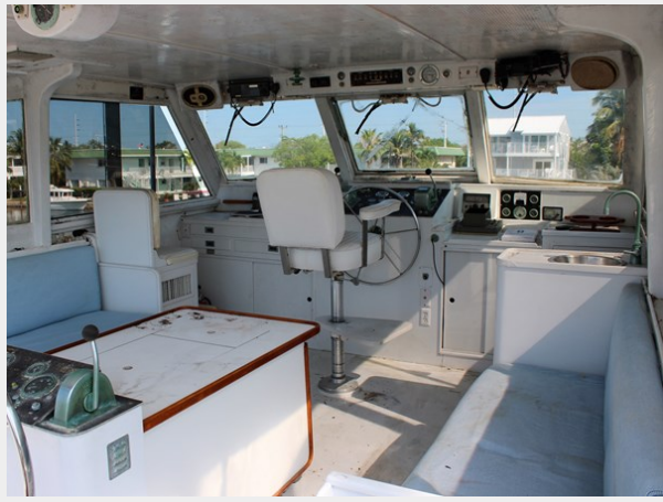
029 Fly Bridge