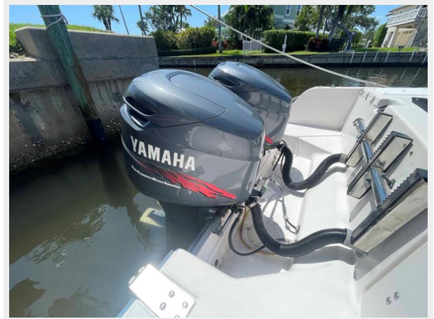
Swim platform and twin Yamaha HPDI's 200hp