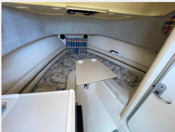
Pop-up table for dining in V-berth