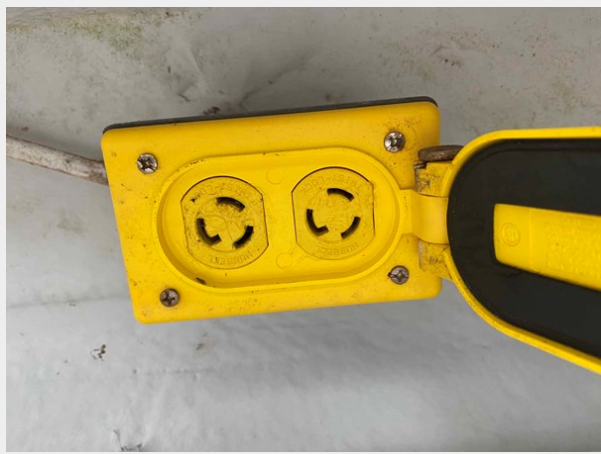
Electric reel receptacle under port cockpit gunwale