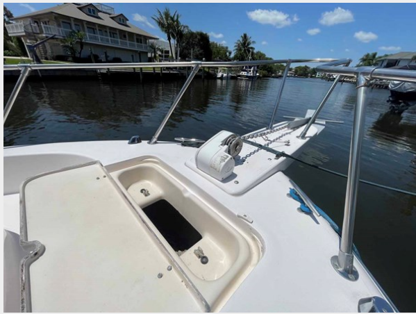
Anchor locker and windlass