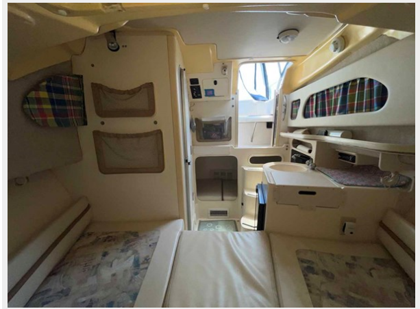
Cabin looking aft from V-berth