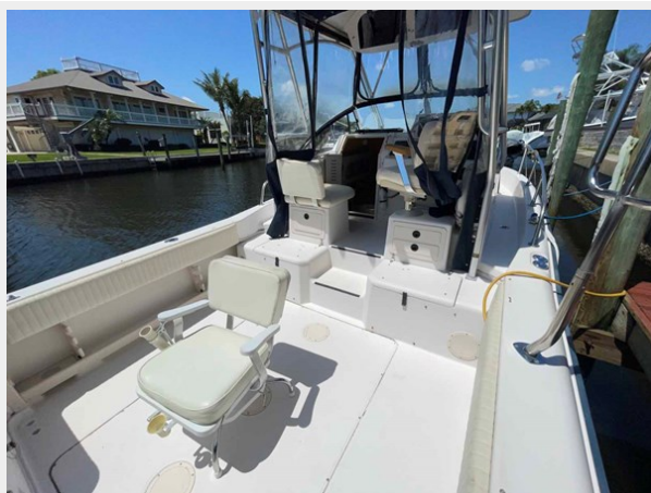
Cockpit looking forward