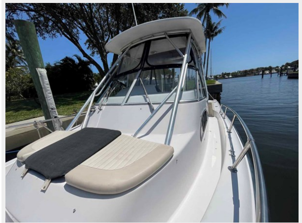
Bow seating area looking aft