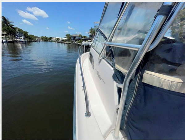
Port side walkway looking forward