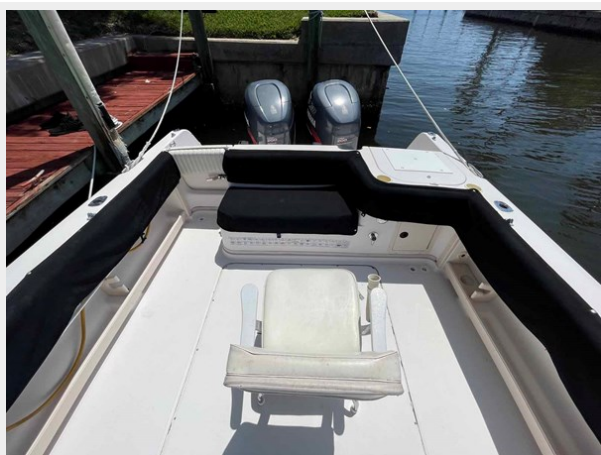
Cockpit looking aft with covers on