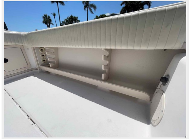
Port side under gunwale rod storage