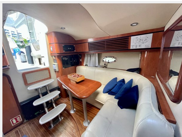
Lounge facing PS