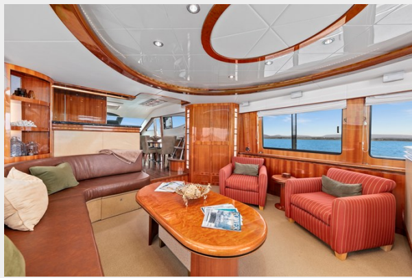
Plenty of seating