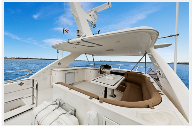
Flying Bridge Deck