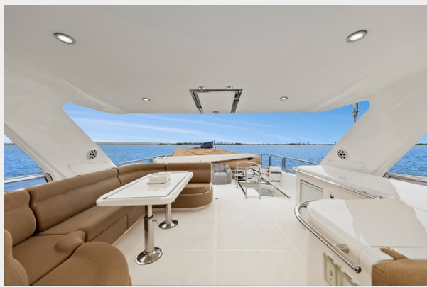
Expansive Flying Bridge