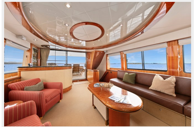
Main Saloon looking aft