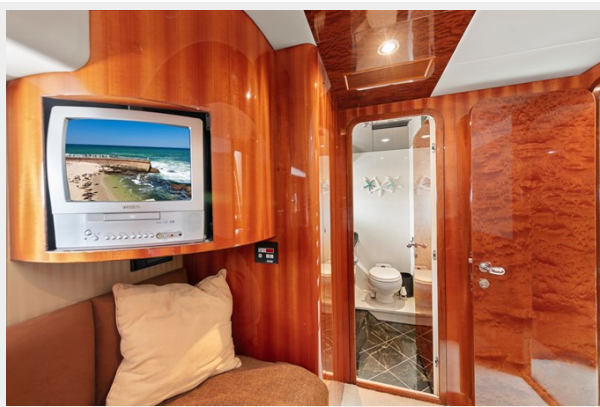
Port Guest Stateroom / Head