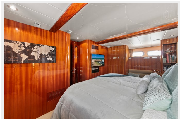
Master Stateroom looking aft, to starboard