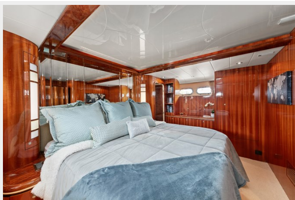
Master Stateroom looking to port