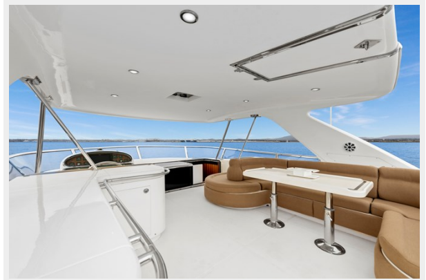
Flying Bridge settee and entertainment cabinetry