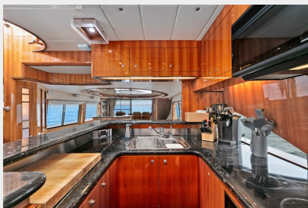
Galley, facing aft