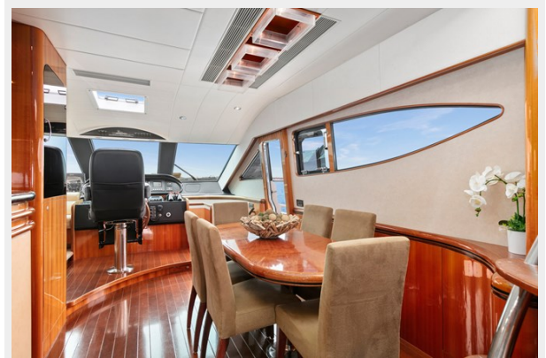
Dining Area, opposite galley