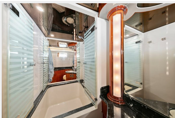
Master Head - centerline