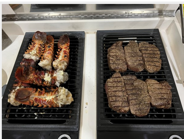
Al Fresco dining?