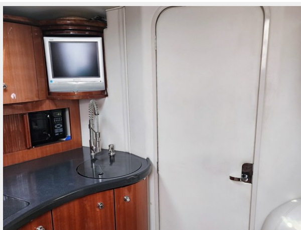
10-013 Mast Stateroom Door