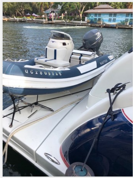
6_2008 45ft Formula 45 Yacht BLUE FANTASY