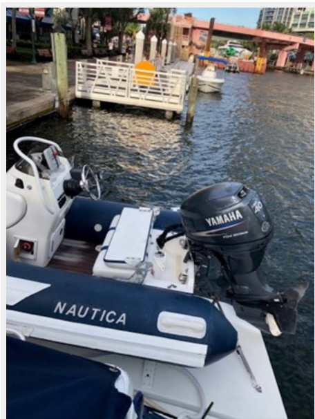
8_2008 45ft Formula 45 Yacht BLUE FANTASY