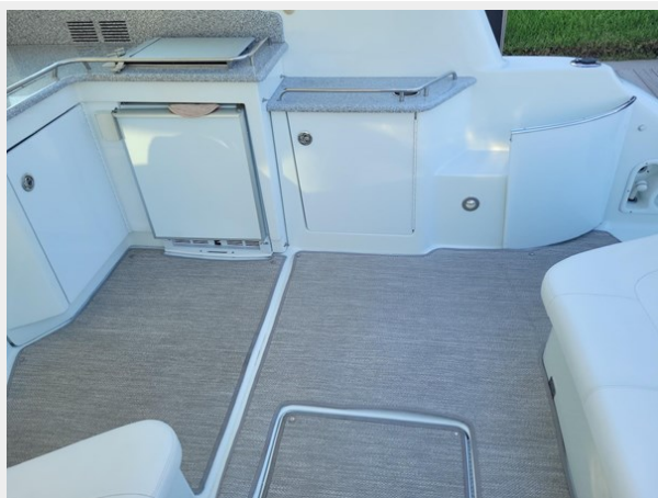
20_2008 45ft Formula 45 Yacht BLUE FANTASY