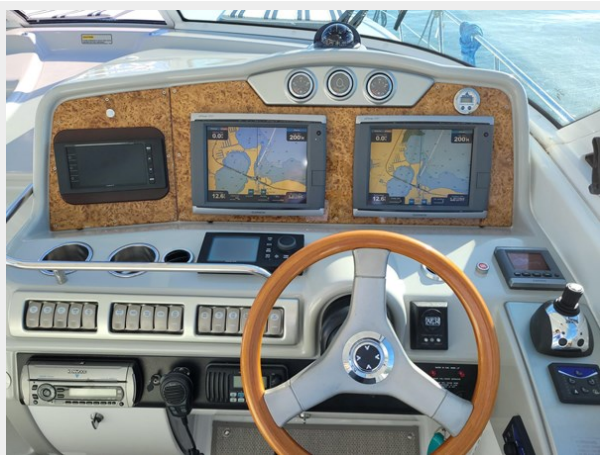
16_2008 45ft Formula 45 Yacht BLUE FANTASY