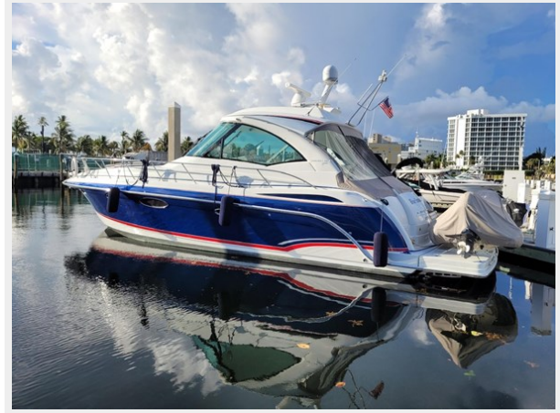
3_2008 45ft Formula 45 Yacht BLUE FANTASY