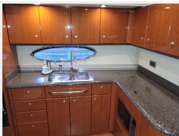
28_2008 45ft Formula 45 Yacht BLUE FANTASY