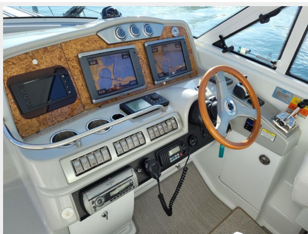
14_2008 45ft Formula 45 Yacht BLUE FANTASY