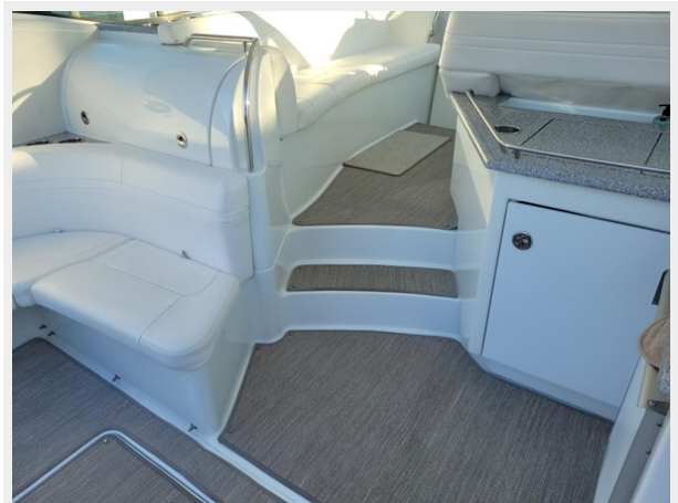
17_2008 45ft Formula 45 Yacht BLUE FANTASY