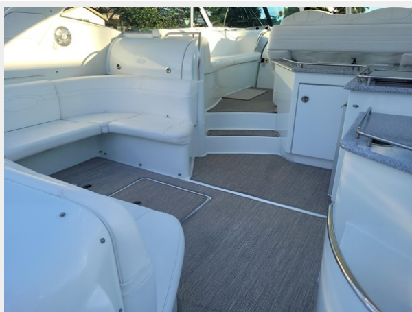
18_2008 45ft Formula 45 Yacht BLUE FANTASY