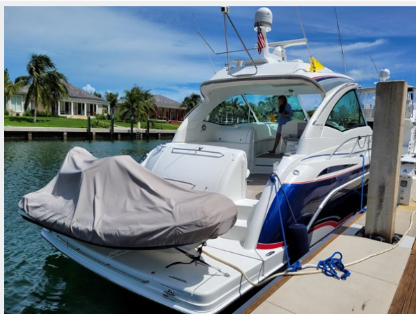
4_2008 45ft Formula 45 Yacht BLUE FANTASY