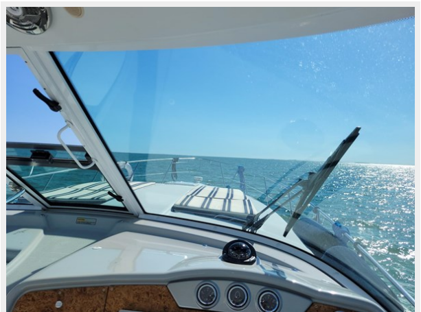
13_2008 45ft Formula 45 Yacht BLUE FANTASY