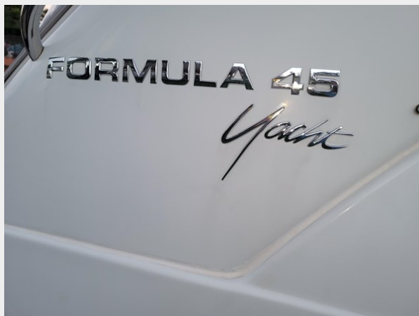
10_2008 45ft Formula 45 Yacht BLUE FANTASY