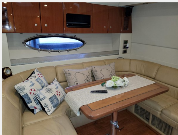
24_2008 45ft Formula 45 Yacht BLUE FANTASY