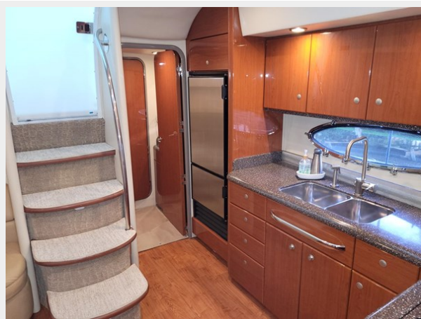
26_2008 45ft Formula 45 Yacht BLUE FANTASY