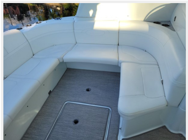
19_2008 45ft Formula 45 Yacht BLUE FANTASY