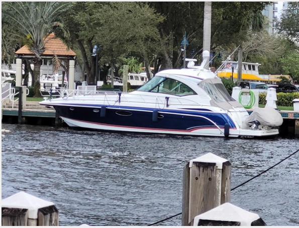
2_2008 45ft Formula 45 Yacht BLUE FANTASY