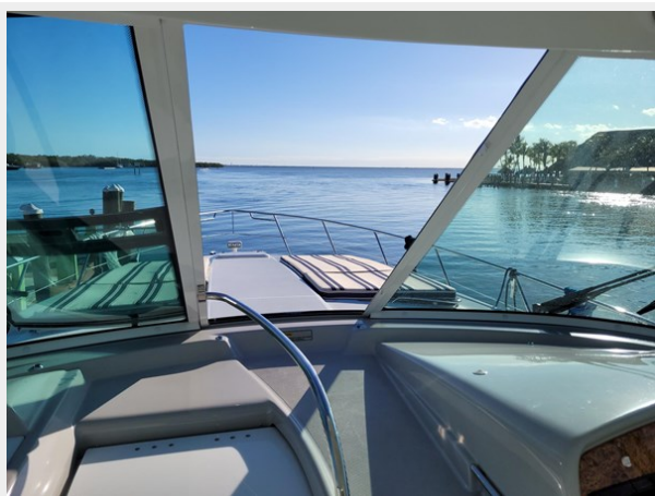
12_2008 45ft Formula 45 Yacht BLUE FANTASY