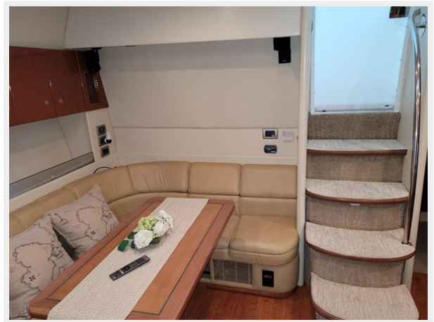
23_2008 45ft Formula 45 Yacht BLUE FANTASY