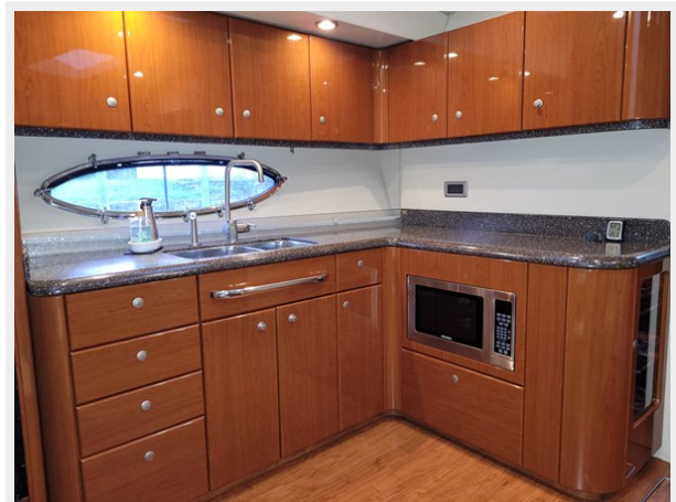
27_2008 45ft Formula 45 Yacht BLUE FANTASY