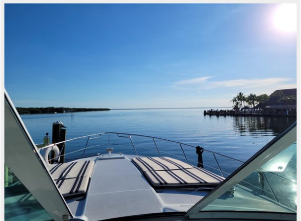
11_2008 45ft Formula 45 Yacht BLUE FANTASY