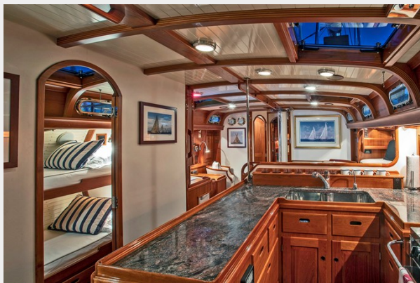
Interior Looking Fwd