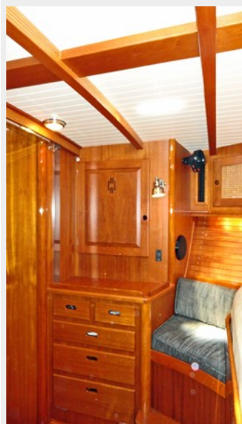
Owners Cabin Port