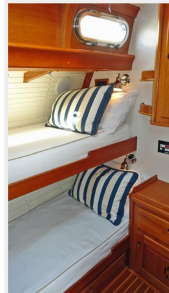
Aft Guest Cabin