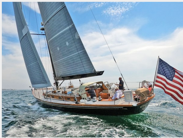
Aft Port Qtr