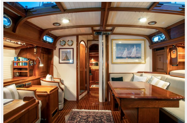
Main Salon Looking Fwd