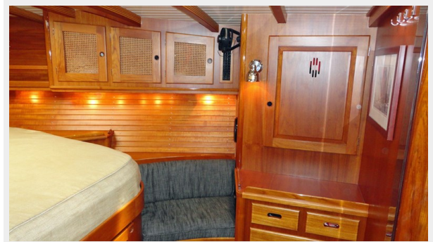
Owners Cabin Stbd