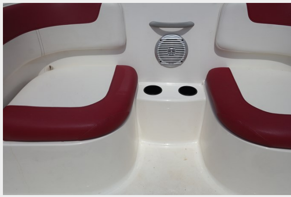
21peaker view port