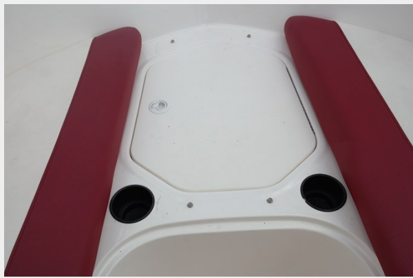
15 anchor storage