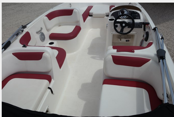
17 forward view