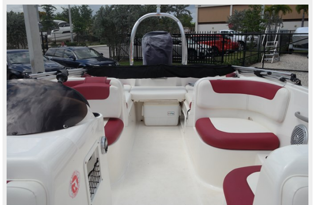
18 aft view