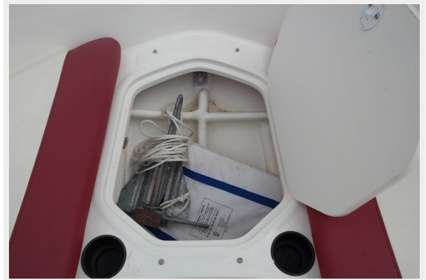
16 anchor compartment