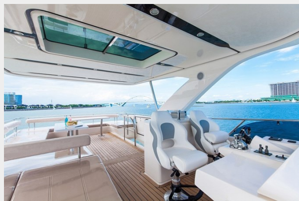
FB facing aft