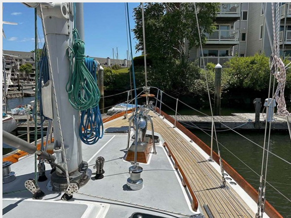
Stbd. Deck, Looking Fwd.