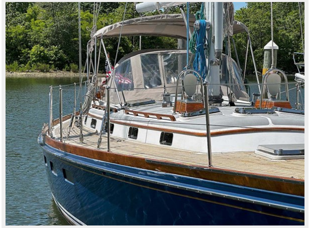
Stbd. Profile at Dock