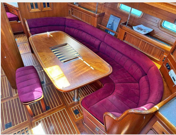
Stbd. Settee and Dinette