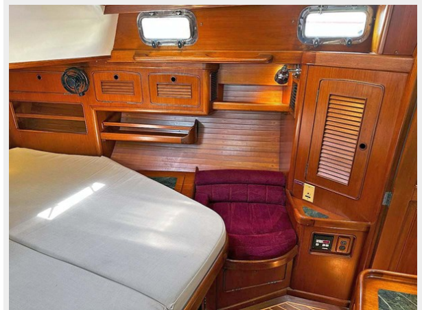
Aft Cabin, Port