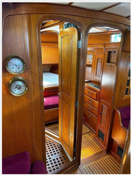
Fwd. Cabin and Head