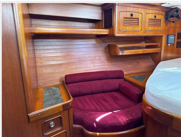
Aft Cabin, Stbd.