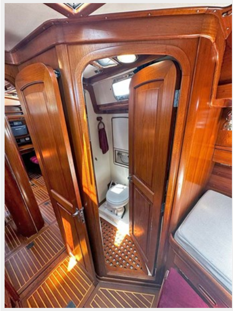
Fwd. Head from Berth