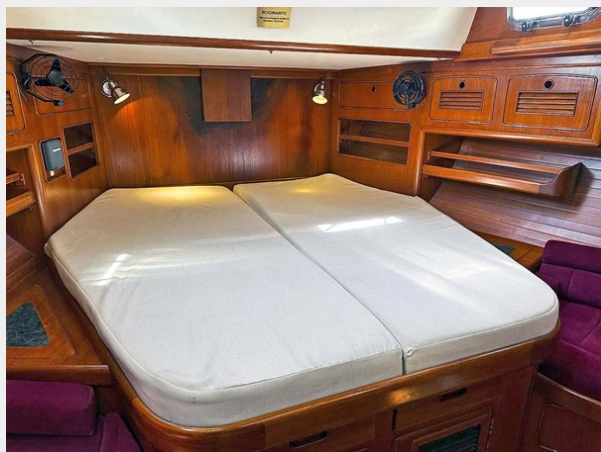
Owner's Cabin, Aft