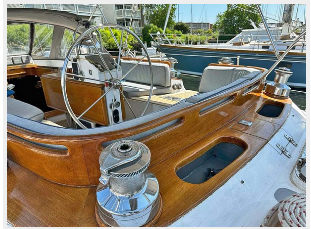
Cockpit Winches, Aft of Helm