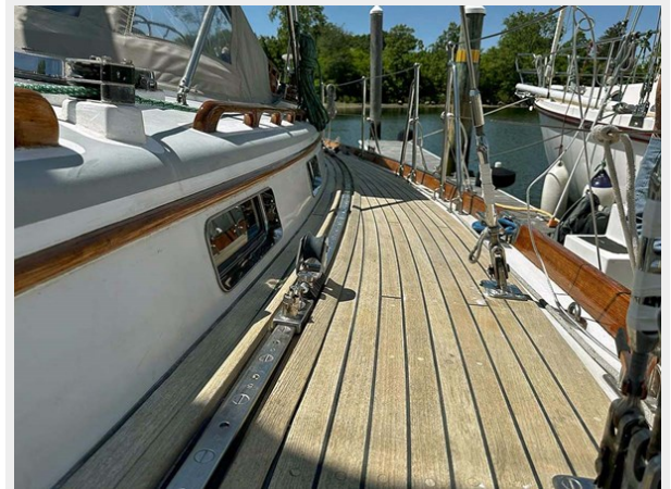
Port Deck, Looking Aft