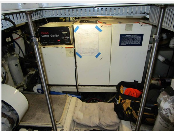
Onan 17kW generator