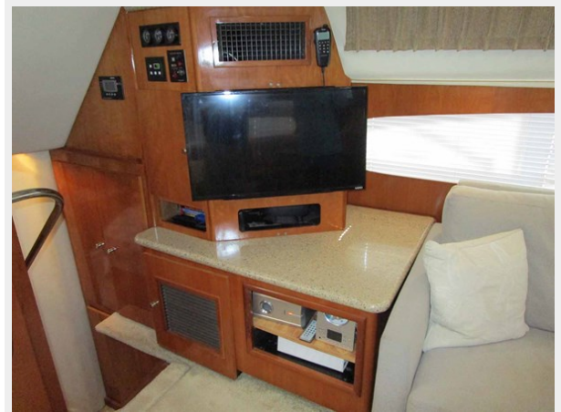
Salon entertainment center