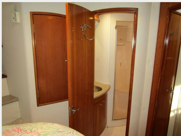
Door from head to fwd stateroom