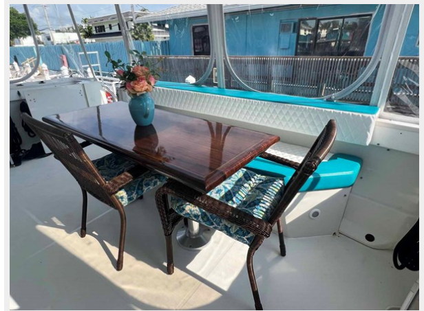
Aft deck dining