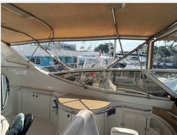
020 - Flybridge to stbd