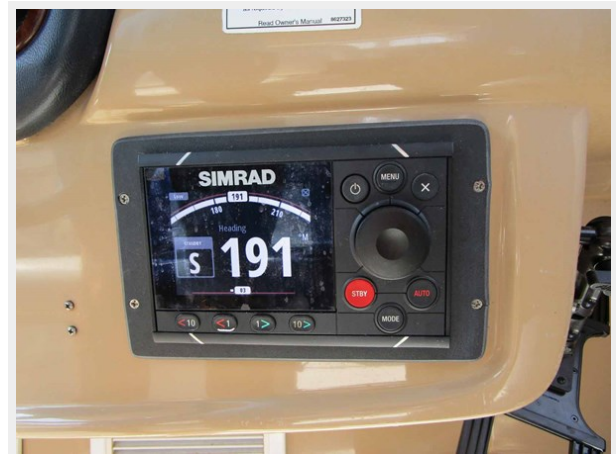
Simrad auto pilot