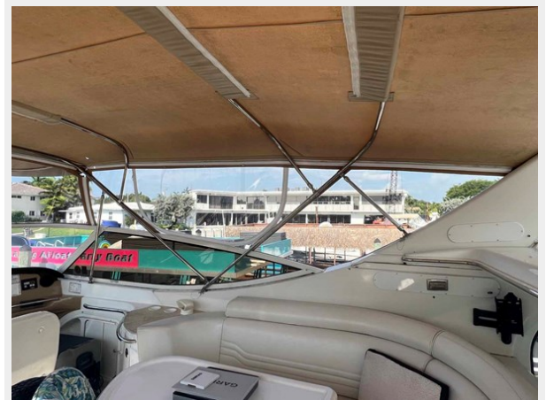
Flybridge to port