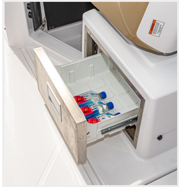
Port Refrigerator Drawer