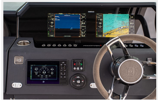
Helm Port View