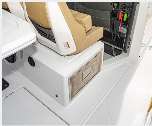
Starboard Refrigerator Drawer