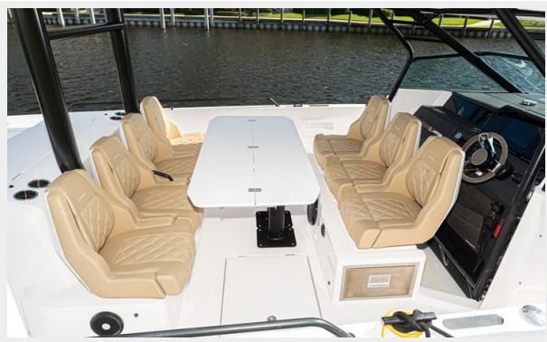
Aft Seating Covered