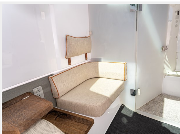
Cabin Starboard Seat