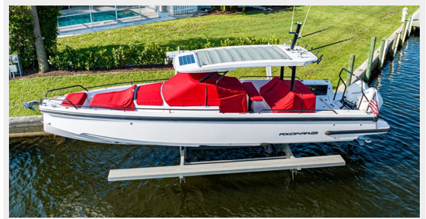
Profile with Covers