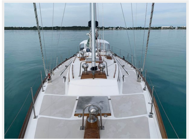
Carbon In-Boom Furler