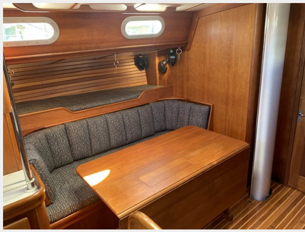
Salon Table Extended