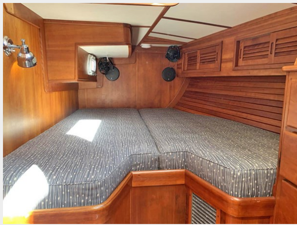
Aft Cabin Outboard