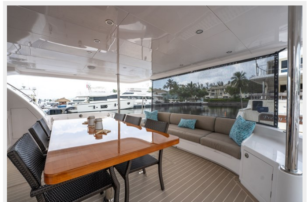
AFT DECK 1