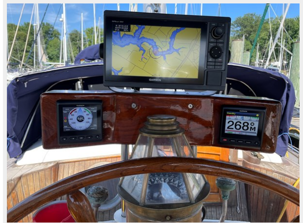
Upgraded Helm Electronics