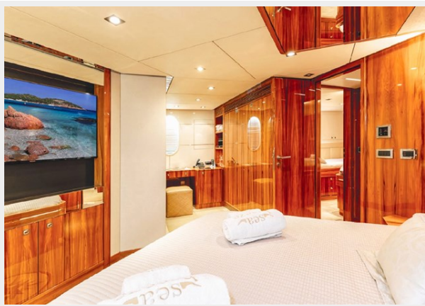
Kaiserwerft Baron 102 SEA BREEZE ONE 33