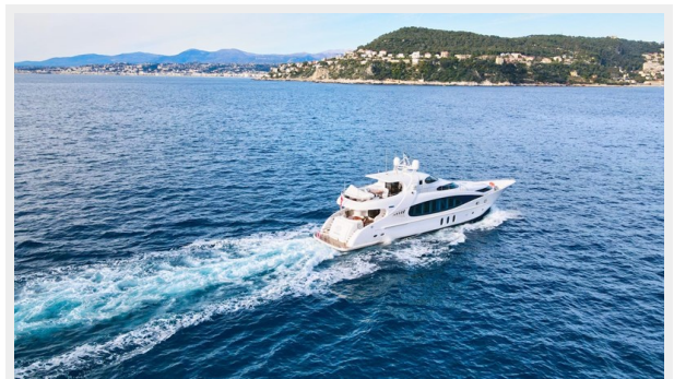
Kaiserwerft Baron 102 SEA BREEZE ONE 6 Kaiserwerft Baron 102 SEA BREEZE ONE 7