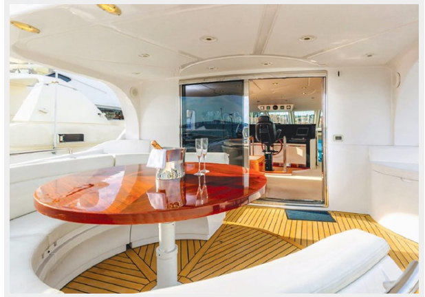
Kaiserwerft Baron 102 SEA BREEZE ONE 15