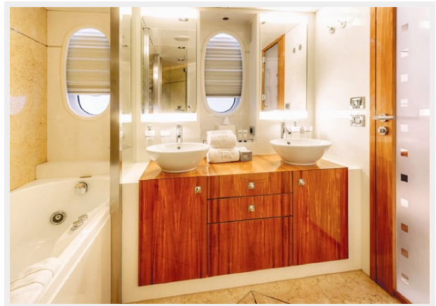
Kaiserwerft Baron 102 SEA BREEZE ONE 36