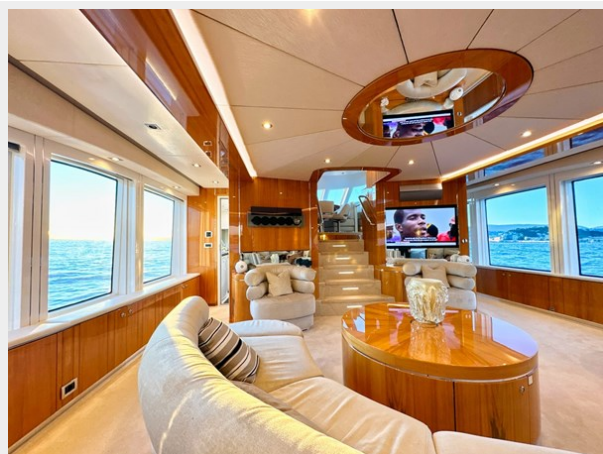
Kaiserwerft Baron 102 SEA BREEZE ONE 22