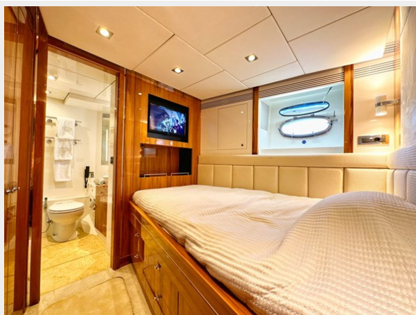
Kaiserwerft Baron 102 SEA BREEZE ONE 39