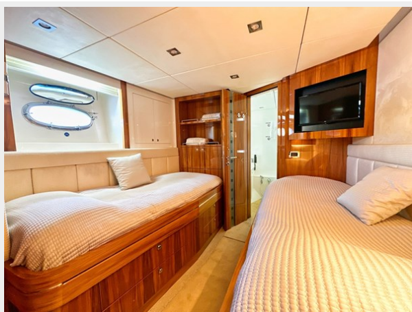
Kaiserwerft Baron 102 SEA BREEZE ONE 37