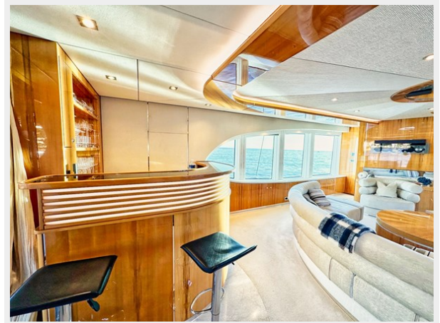
Kaiserwerft Baron 102 SEA BREEZE ONE 21