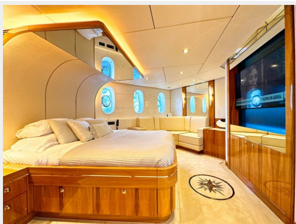
Kaiserwerft Baron 102 SEA BREEZE ONE 31