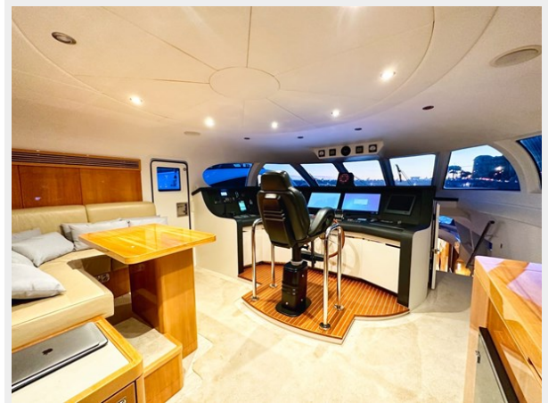
Kaiserwerft Baron 102 SEA BREEZE ONE 25