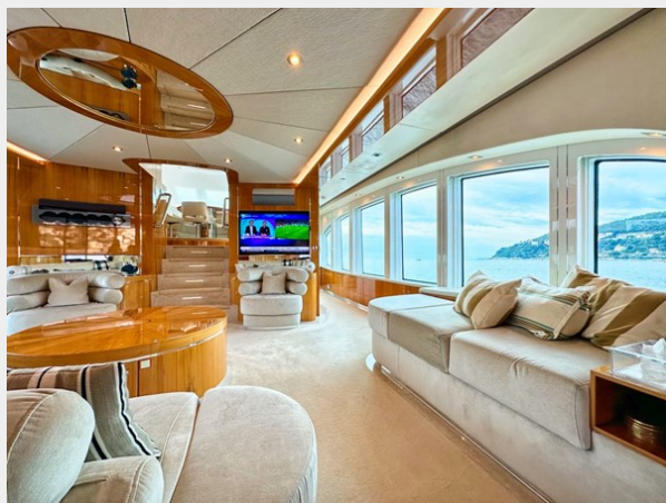
Kaiserwerft Baron 102 SEA BREEZE ONE 24