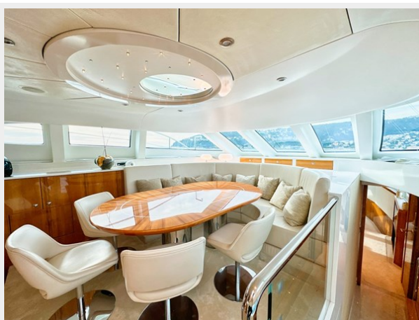
Kaiserwerft Baron 102 SEA BREEZE ONE 42