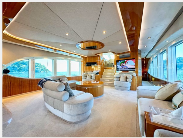
Kaiserwerft Baron 102 SEA BREEZE ONE 20