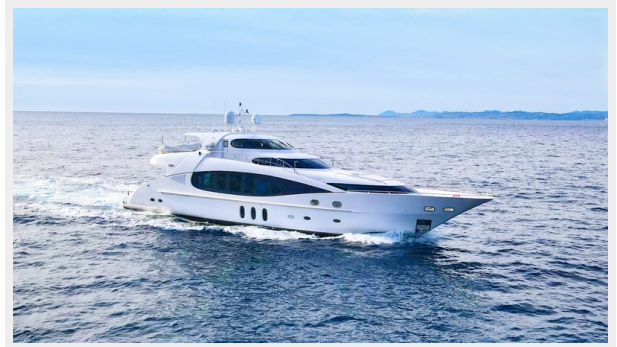
Kaiserwerft Baron 102 SEA BREEZE ONE 4 Kaiserwerft Baron 102 SEA BREEZE ONE 5