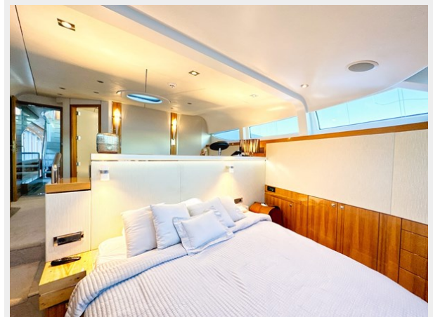
Kaiserwerft Baron 102 SEA BREEZE ONE 30