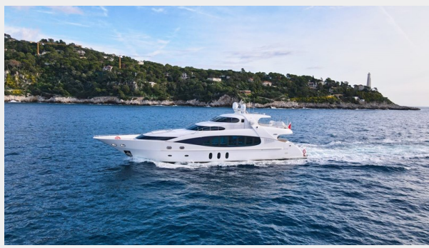
Kaiserwerft Baron 102 SEA BREEZE ONE 1 Kaiserwerft Baron 102 SEA BREEZE ONE 2