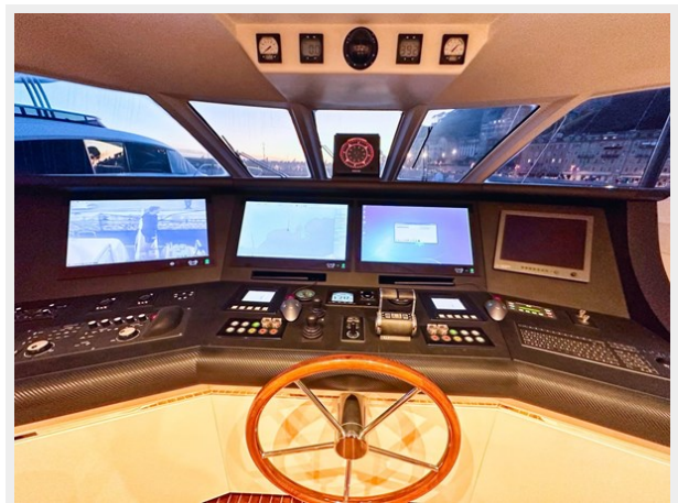
Kaiserwerft Baron 102 SEA BREEZE ONE 27