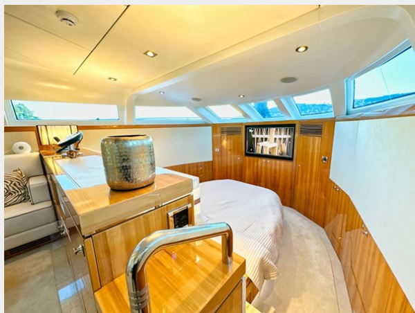
Kaiserwerft Baron 102 SEA BREEZE ONE 29