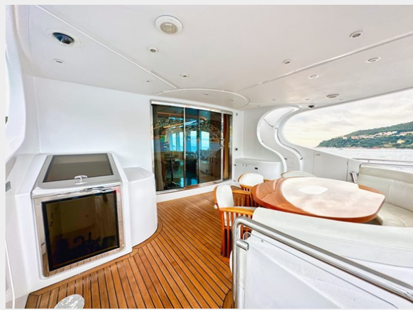
Kaiserwerft Baron 102 SEA BREEZE ONE 14