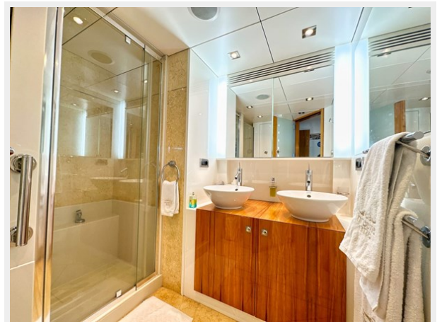
Kaiserwerft Baron 102 SEA BREEZE ONE 38