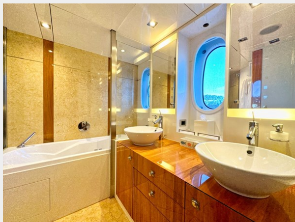
Kaiserwerft Baron 102 SEA BREEZE ONE 35