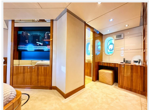
Kaiserwerft Baron 102 SEA BREEZE ONE 32