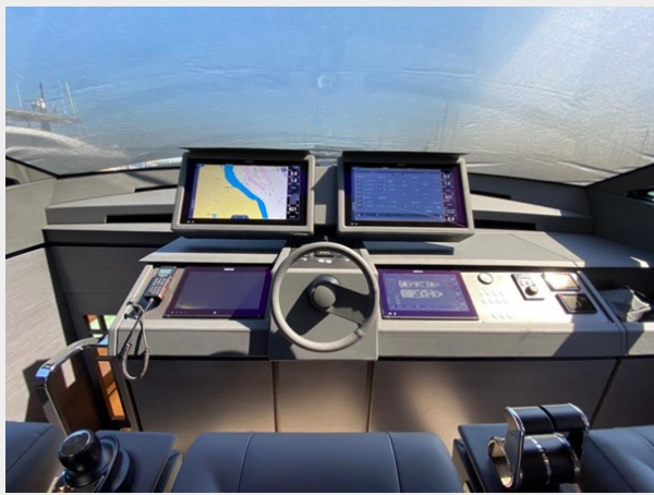
Interior Helm Station main