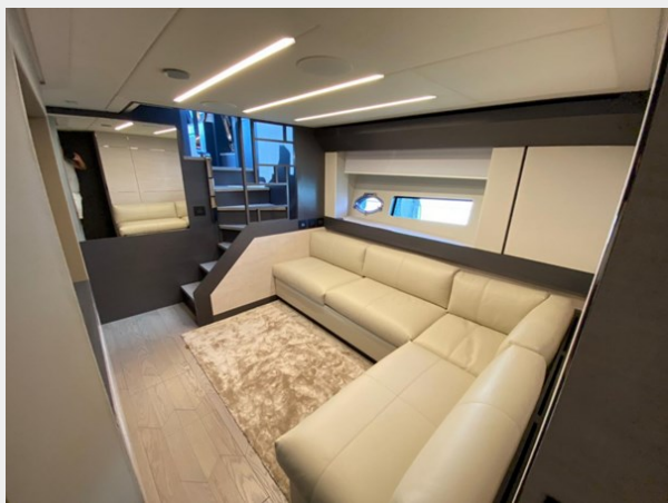
Lower deck lounge 2