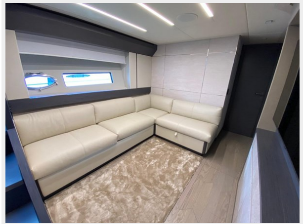
Lower deck lounge