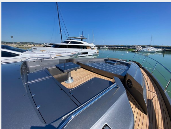
Bow Sunbathing table