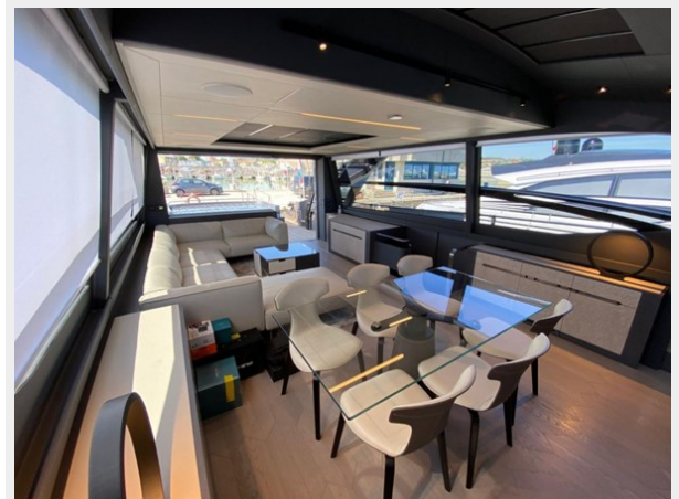
Dining table + lounge