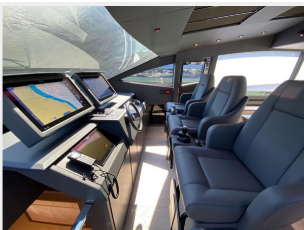
Interior Helm Station