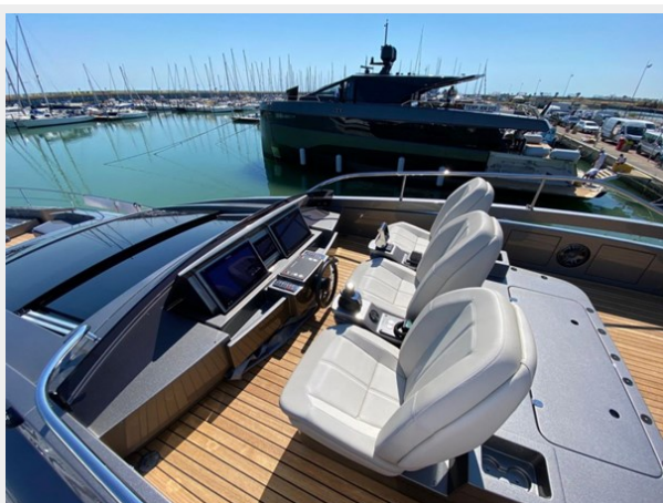
Flybridge Helm Station Side