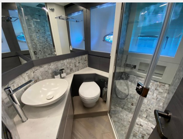
Twin Cabin Head