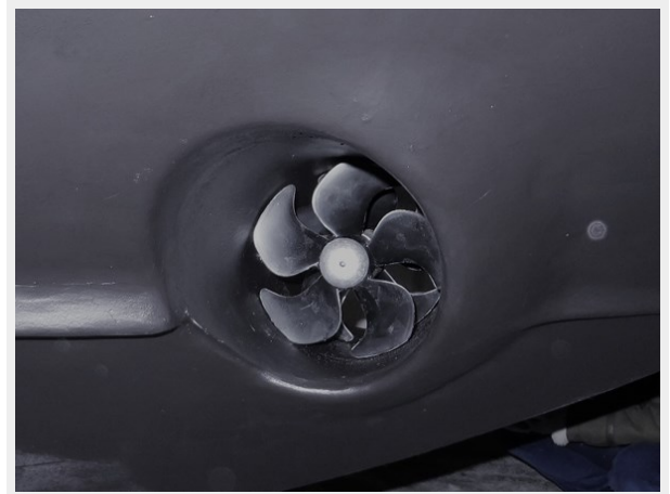
bow thruster 3 001