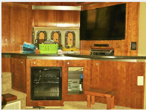
boat clean March 27 002