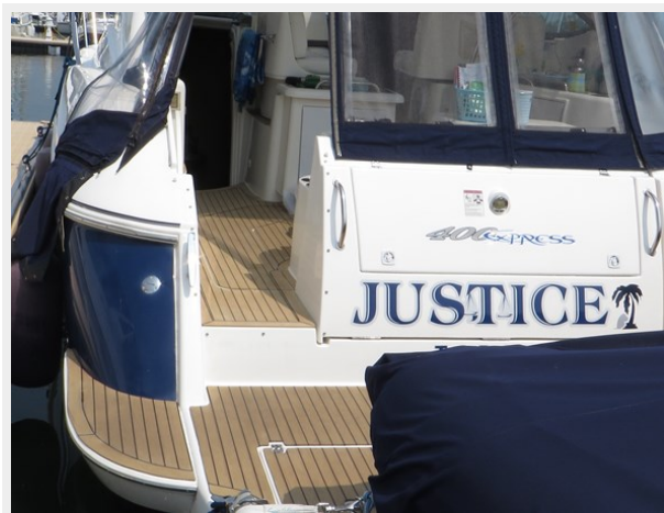
Aug 1,2014 001