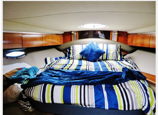
Sept 8 010