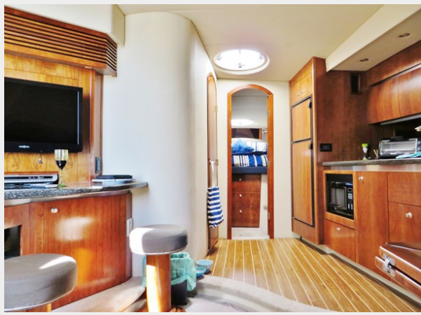
Sept 8 009