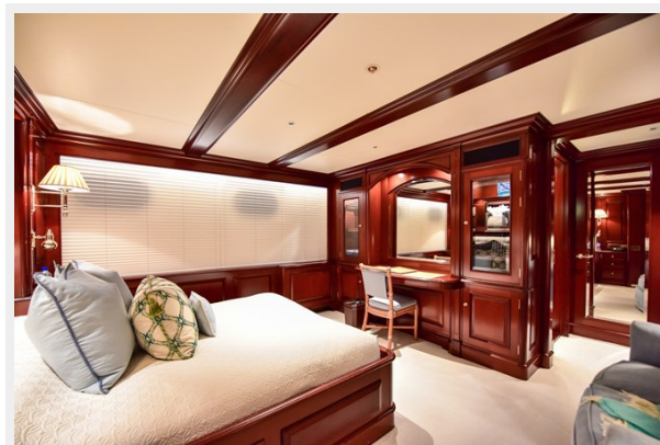
Guest Stateroom 2