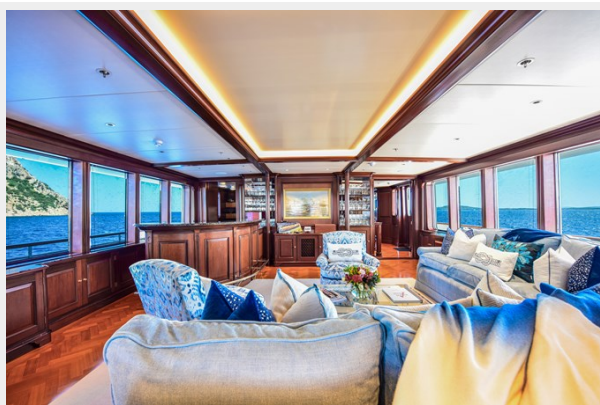
Sky Lounge 1