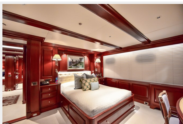
Guest Stateroom 1