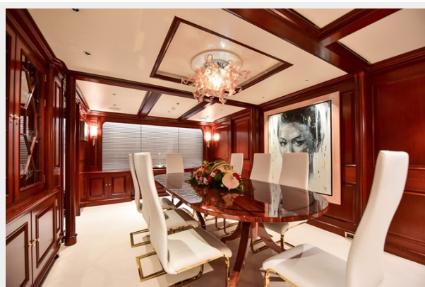
Main Deck Dining 1