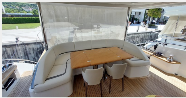
Princess X80 PERLA aft cockpit