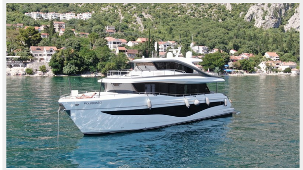
Princess X80 PERLA exterior