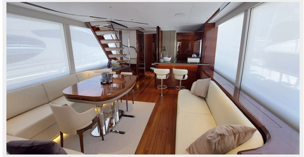
Princess X80 PERLA main deck saloon_1