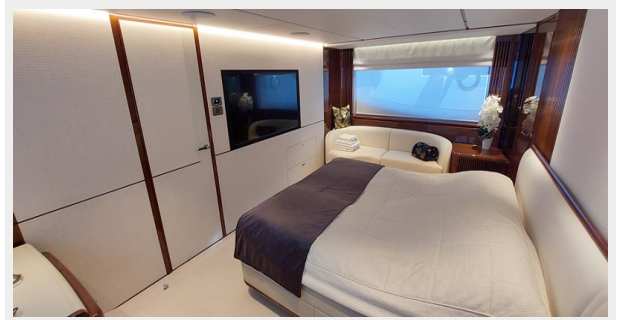
Princess X80 PERLA master cabin full beam