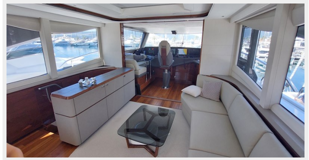
Princess X80 PERLA flybridge enclosed saloon_1