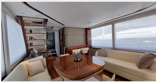
Princess X80 PERLA main deck saloon galley covered