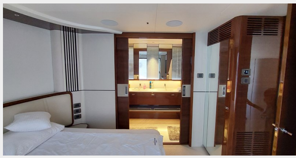
Princess X80 PERLA main cabin