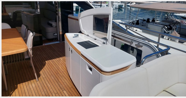
Princess X80 PERLA flybridge BBQ