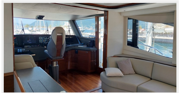
Princess X80 PERLA flybridge helm station