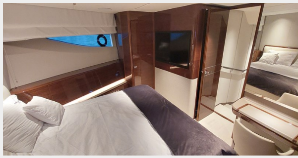
Princess X80 PERLA mid guest cabin