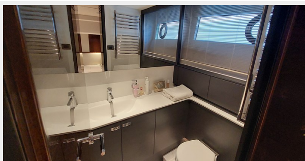
Princess X80 PERLA master cabin bathroom