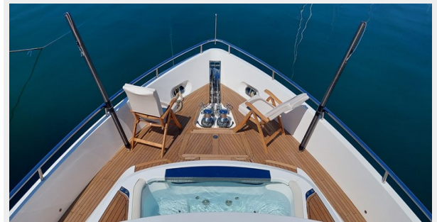
Princess X80 PERLA bow lounge with jacuzzi