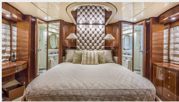
011 DOLCE_VITA_master stateroom -28