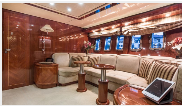
008 DOLCE_VITA_main salon -55