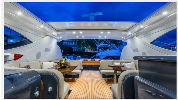
006 DOLCE_VITA_upper deck lounge -62