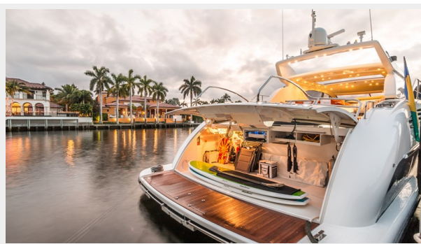
035 DOLCE_VITA_garage -58