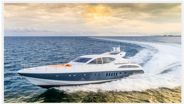
042 DOLCE_VITA_port running -47