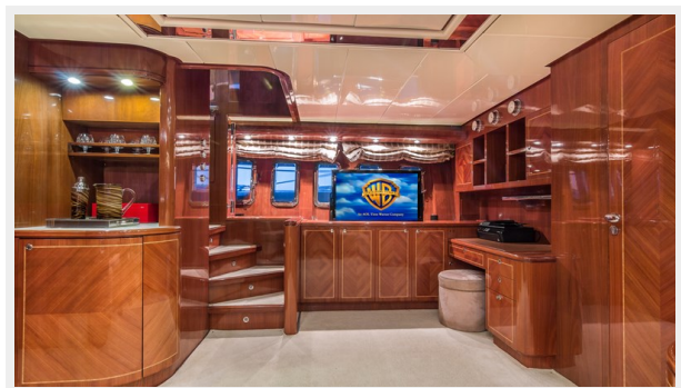
009 DOLCE_VITA_main salon -56