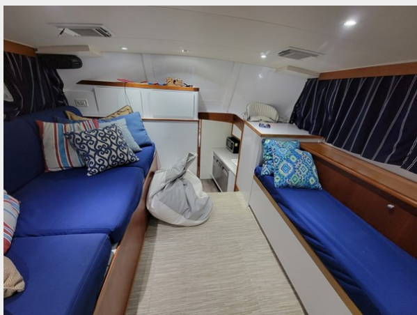
Salon looking fwd