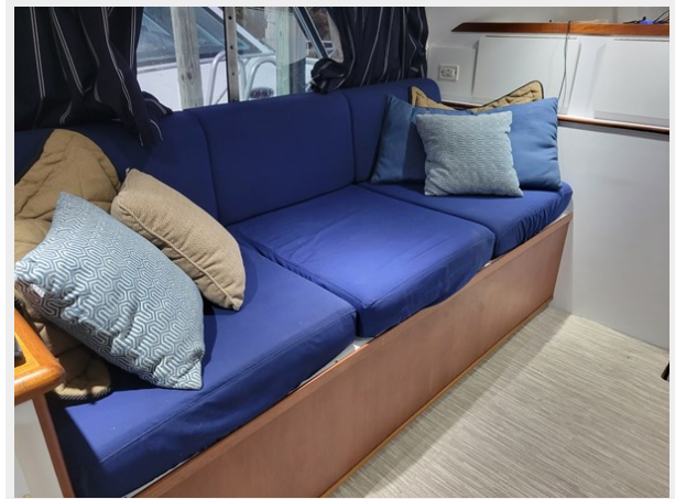
Port Salon Settee