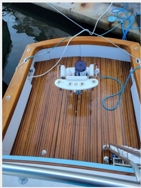
New teak deck