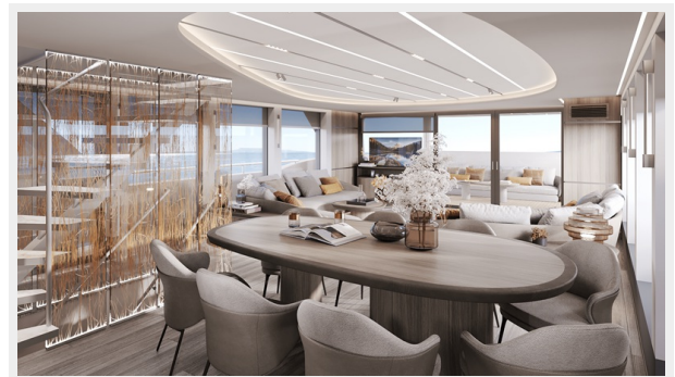
Living Room 3