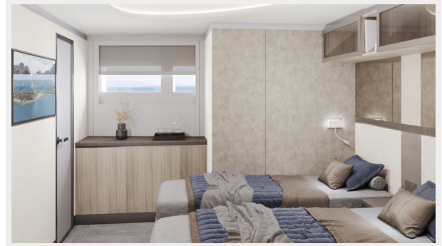
Guest Stateroom_Twin Bed 1