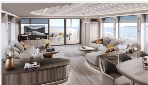
Living Room 1