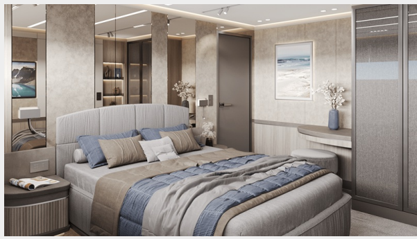
Guest Stateroom_French Bed 2