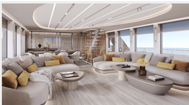
Living Room 4