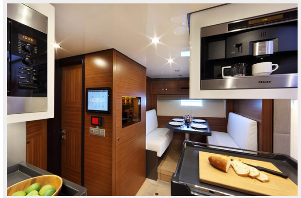
PATEA - Galley