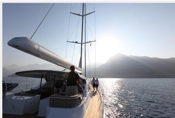
PATEA - Deck