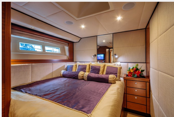
PATEA - Guest Cabin