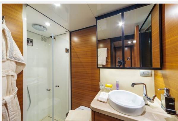
PATEA - Master Cabin