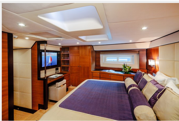
PATEA - Master Cabin