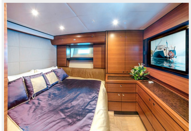
PATEA - Guest Cabin