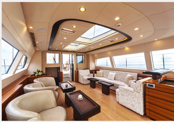
PATEA - Saloon