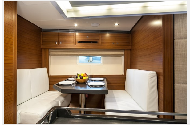
PATEA - Galley