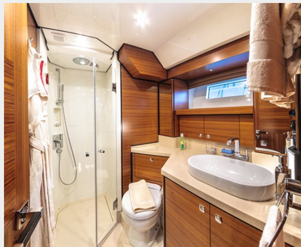
PATEA - Guest Cabin