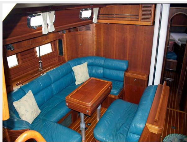
Salon Table Folded