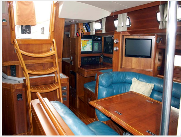
Salon Aft, Nav Area