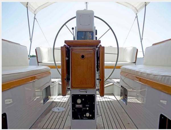
Cockpit, Looking Aft