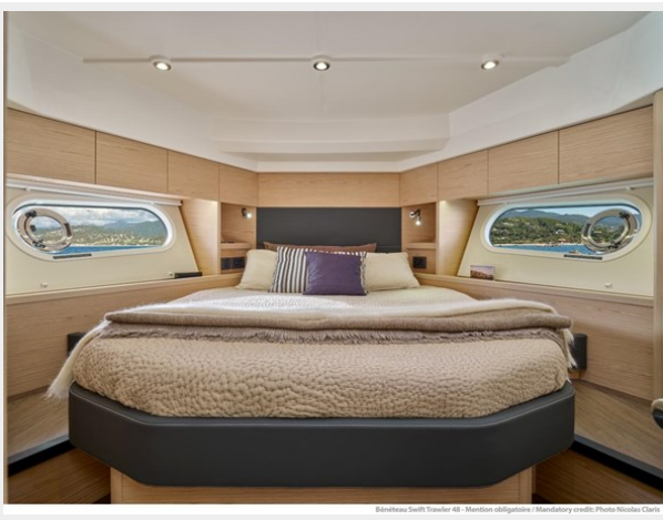
Beneteau Swift Trawler 48