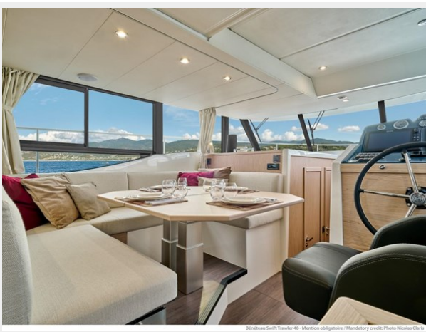
Beneteau Swift Trawler 48