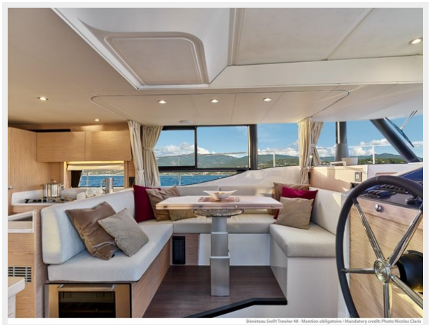
Beneteau Swift Trawler 48