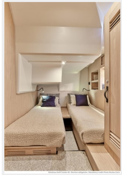
Beneteau Swift Trawler 48