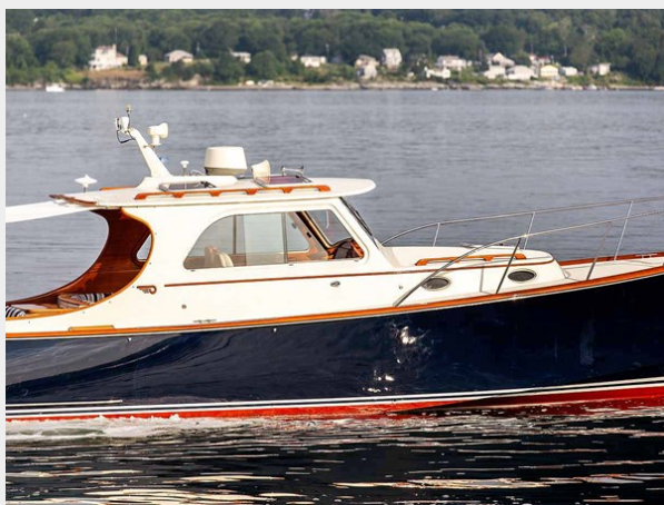
Pilothouse Starboard Beam