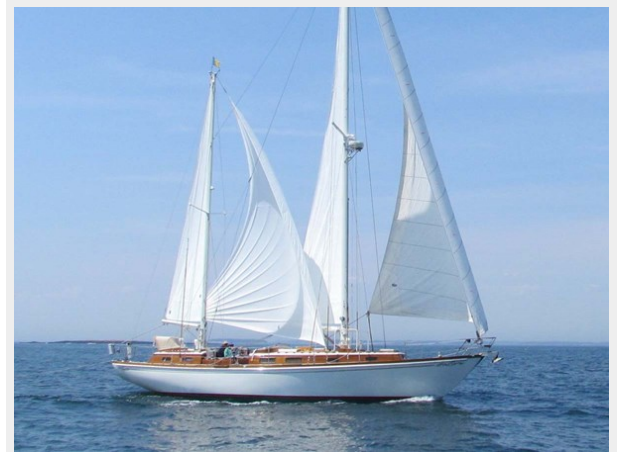
Under Sail with Double-Winged Genoas