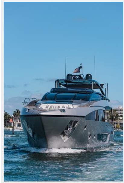
027 Hanna_90' (1)