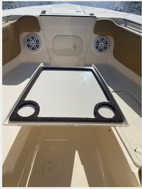
IMG_7424 forward table