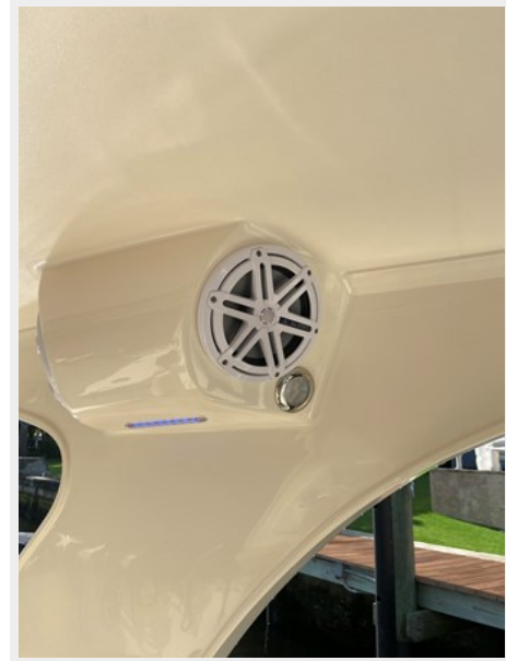
IMG_7423 helm speakers