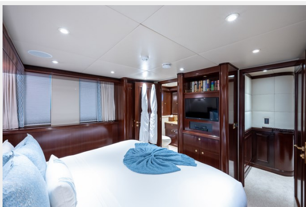
Port VIP Stateroom