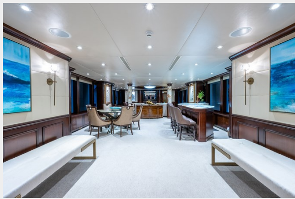
Main Salon Entrance