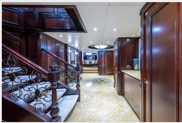
Main Deck Foyer