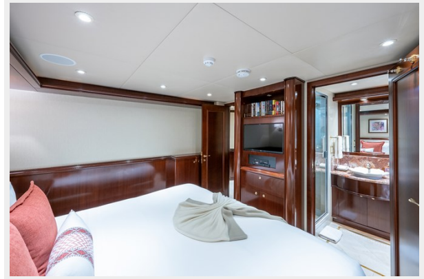
Starboard VIP Stateroom