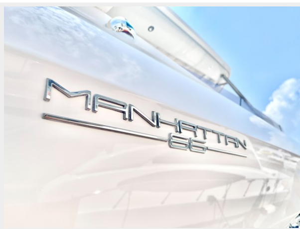
Sunseeker Manhattan 66 - Decals