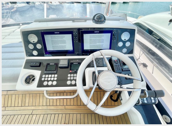
Sunseeker Manhattan 66 - Flybridge Helm