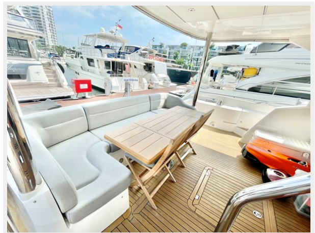
Sunseeker Manhattan 66 - Cockpit