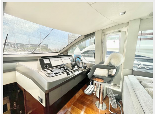
Sunseeker Manhattan 66 - Lower Helm