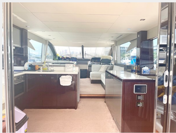
Sunseeker Manhattan 66 - Main Deck