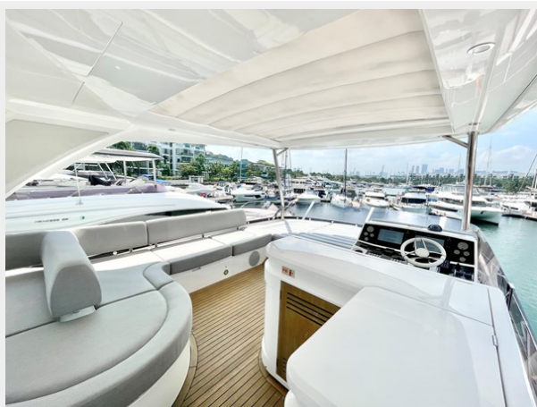
Sunseeker Manhattan 66 - Flybridge