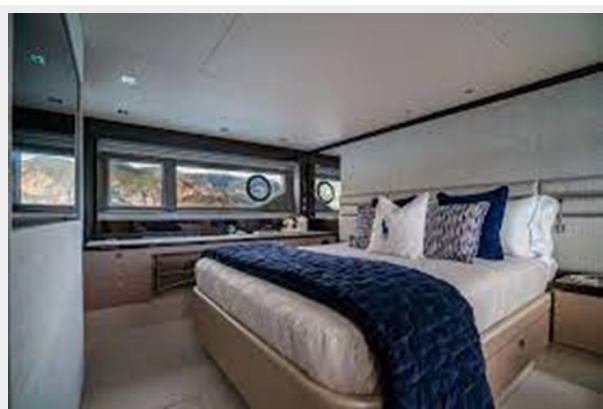
Sunseeker Manhattan 66 - Master Stateroom (Sistership)