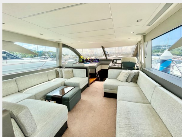
Sunseeker Manhattan 66 - Saloon