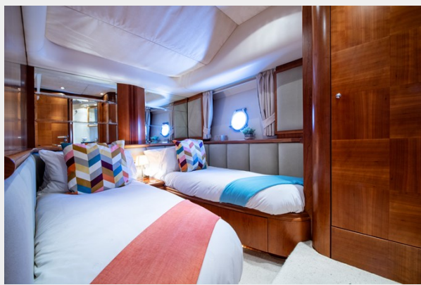
Port Guest Cabin