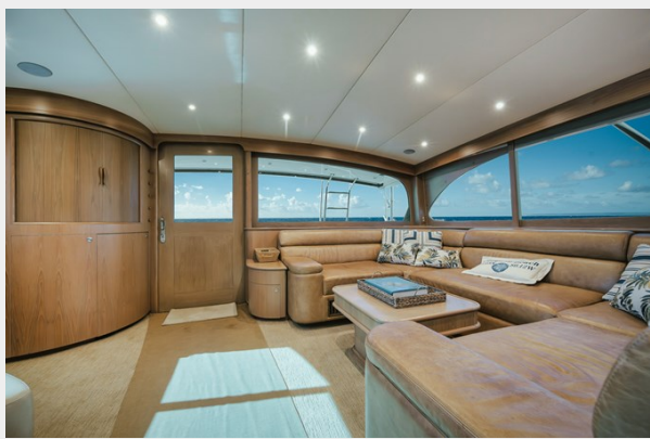
25 - Z9D_2694 - Copy-Enhanced-NR