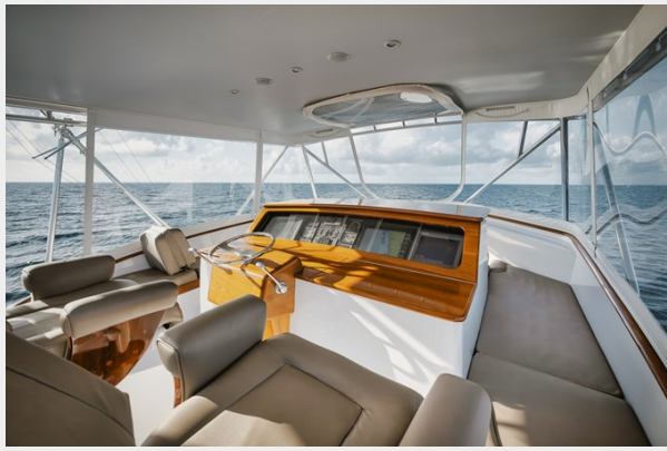
20 - Z9D_2659-Enhanced-NR