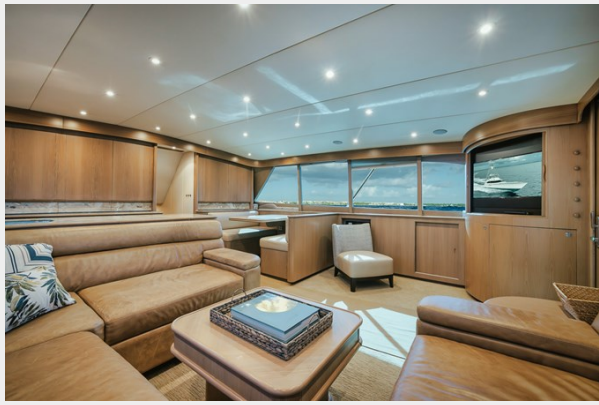
27 - Z9D_2705 - Copy-Enhanced-NR