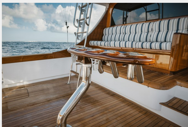
10 - Z9D_2477-Enhanced-NR