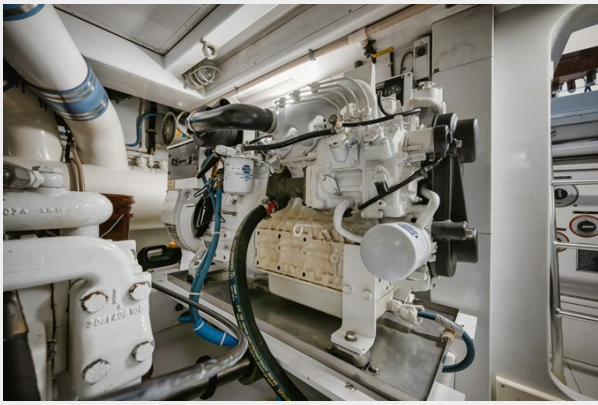
39 - Z9D_2397-Enhanced-NR