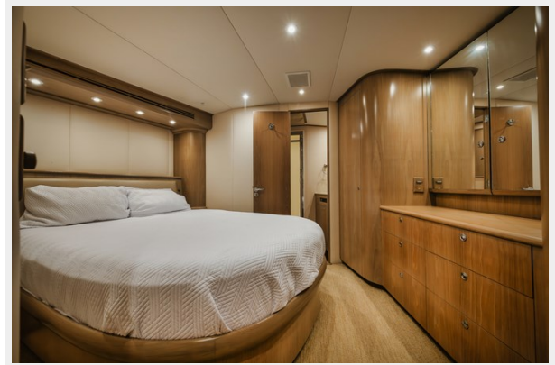
30 - Z9D_2432-Enhanced-NR