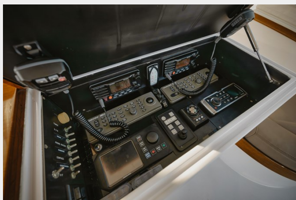
16 - Z9D_2607-Enhanced-NR