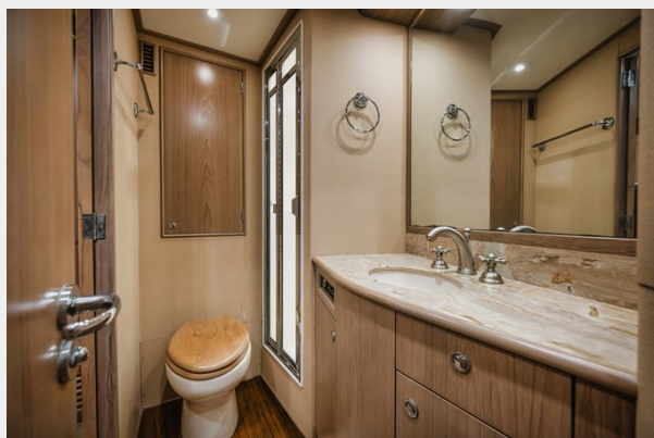
33 - Z9D_2429-Enhanced-NR