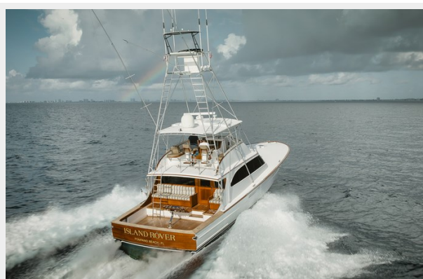
04 - DJI_0764-Enhanced-NR