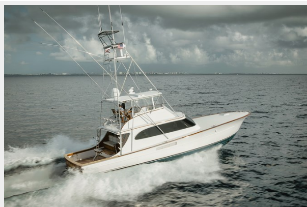
02 - DJI_0722-Enhanced-NR