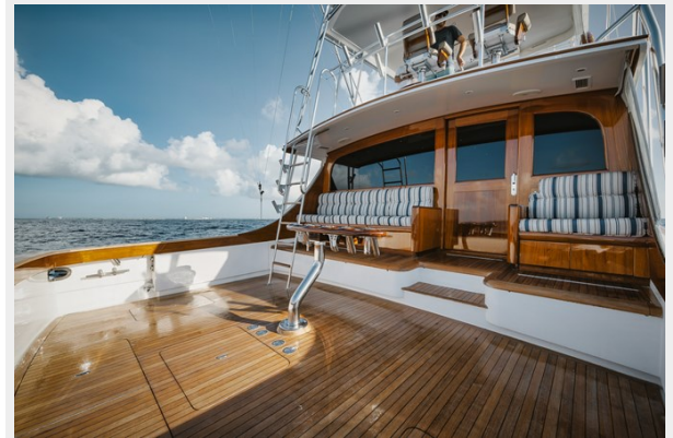
09 - Z9D_2465-Enhanced-NR