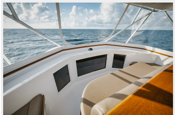
17 - Z9D_2611-Enhanced-NR