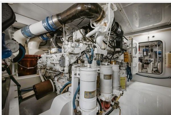
37 - Z9D_2393-Enhanced-NR