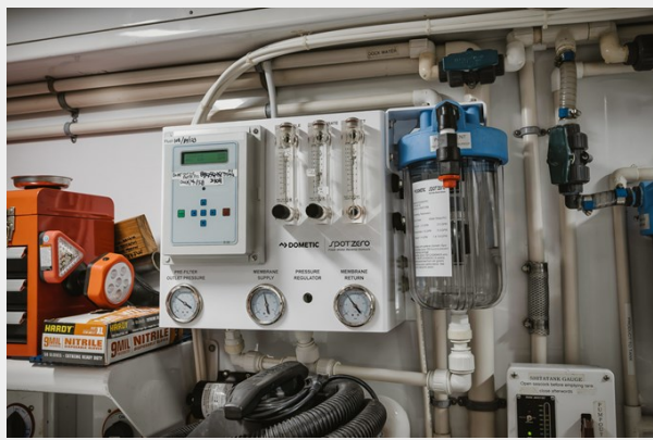
42 - Z9D_2409-Enhanced-NR