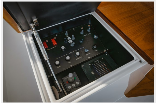
15 - Z9D_2599-Enhanced-NR