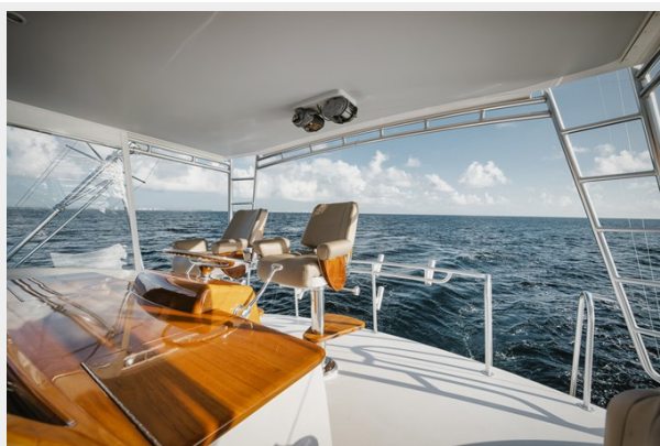
18 - Z9D_2620-Enhanced-NR