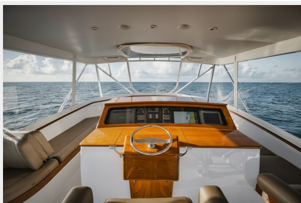
12 - Z9D_2539-Enhanced-NR