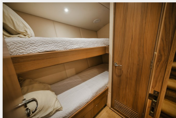
34 - Z9D_2418-Enhanced-NR