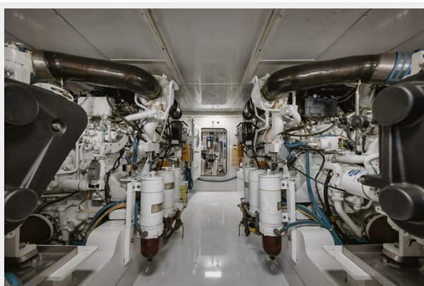
35 - Z9D_2389-Enhanced-NR