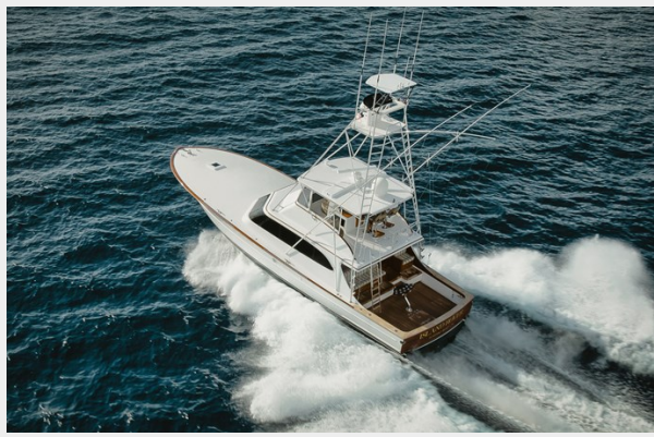
08 - DJI_0804-Enhanced-NR