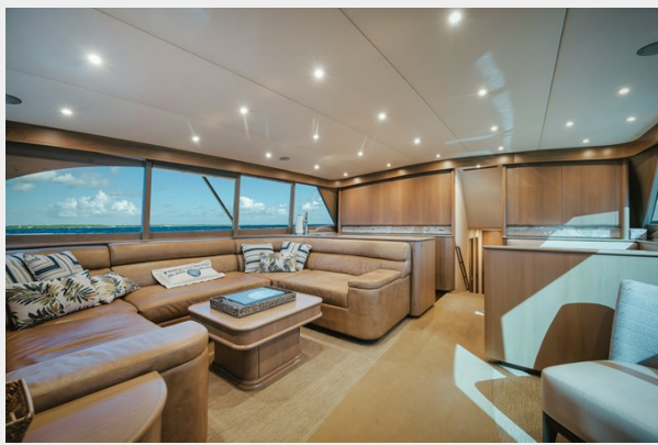
23 - Z9D_2682 - Copy-Enhanced-NR