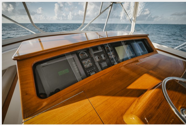
14 - Z9D_2585-Enhanced-NR