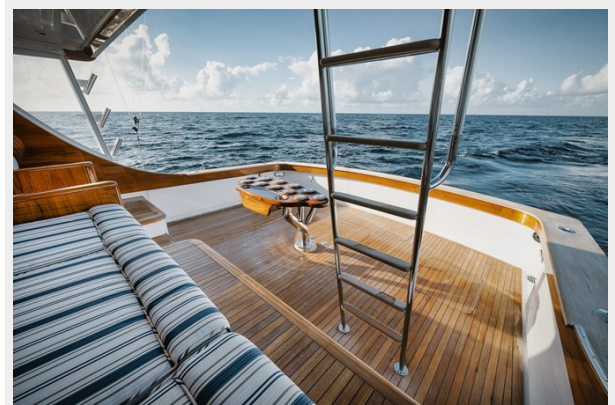
11 - Z9D_2491-Enhanced-NR