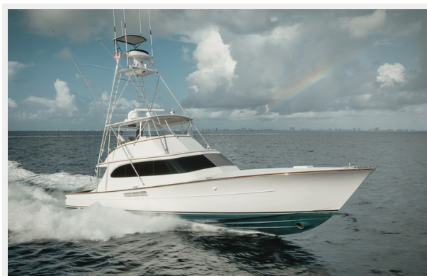
05 - DJI_0749-Enhanced-NR