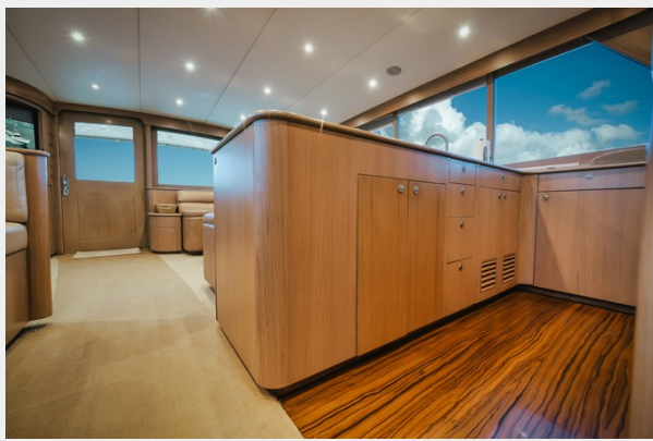
29 - Z9D_2730-Enhanced-NR