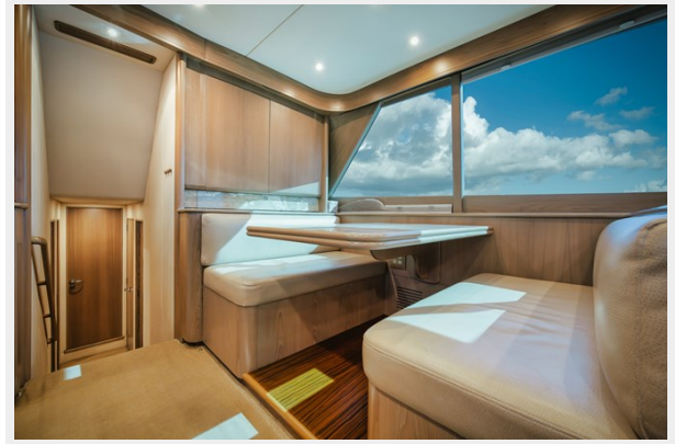
28 - Z9D_2681 - Copy-Enhanced-NR