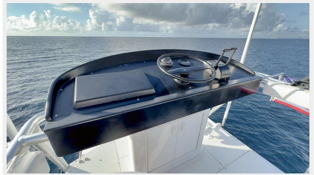
21 - Photo Aug 08 2023, 8 42 38 AM-Enhanced-SR