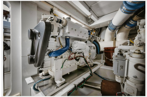
40 - Z9D_2399-Enhanced-NR