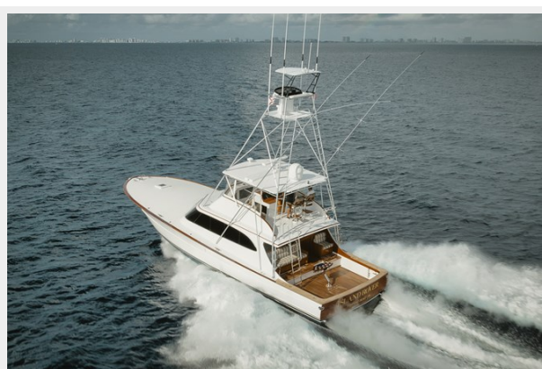
06 - DJI_0789-Enhanced-NR