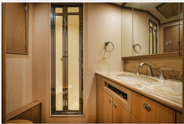
31 - Z9D_2441-Enhanced-NR