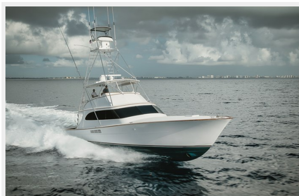
03 - DJI_0733-Enhanced-NR