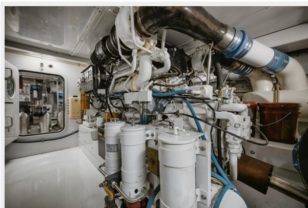
36 - Z9D_2394-Enhanced-NR