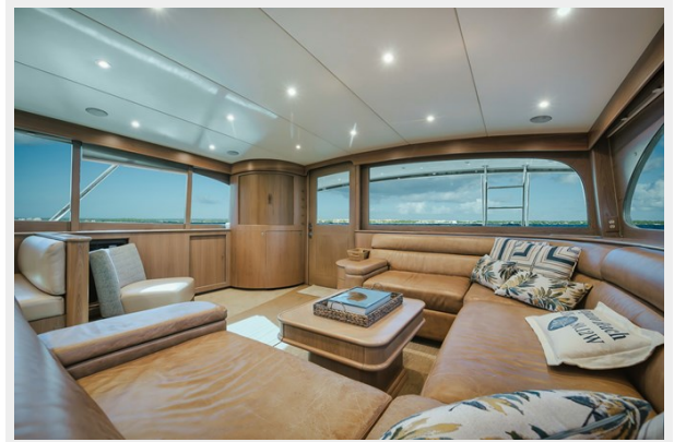
24 - Z9D_2691 - Copy-Enhanced-NR