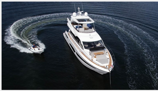
68_ Sunseeker (2)