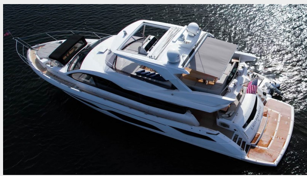
68_ Sunseeker (11)