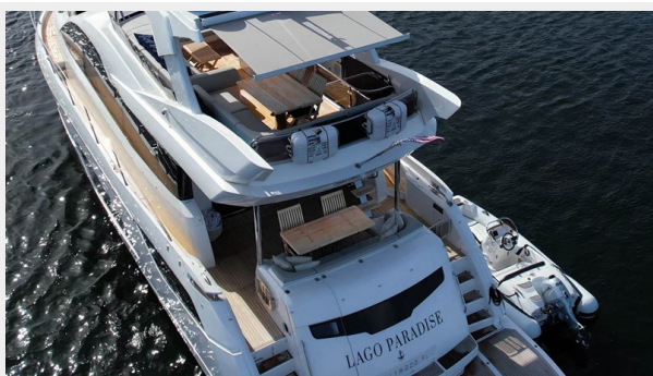
68_ Sunseeker (33)