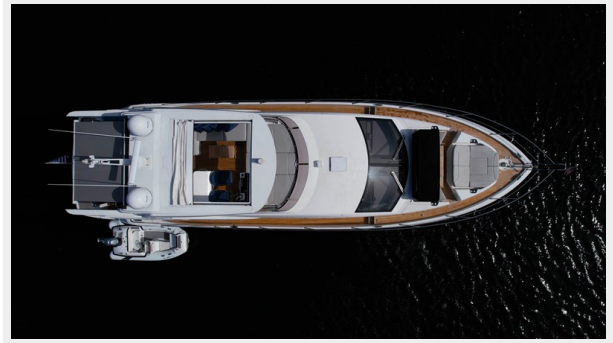
68_ Sunseeker (21)