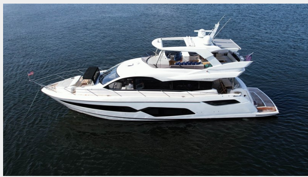
68_ Sunseeker (9)