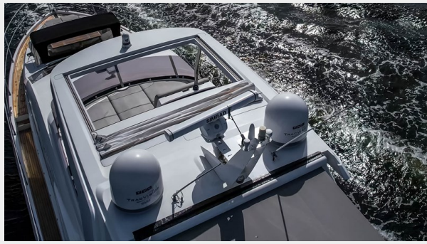
68_ Sunseeker (35)