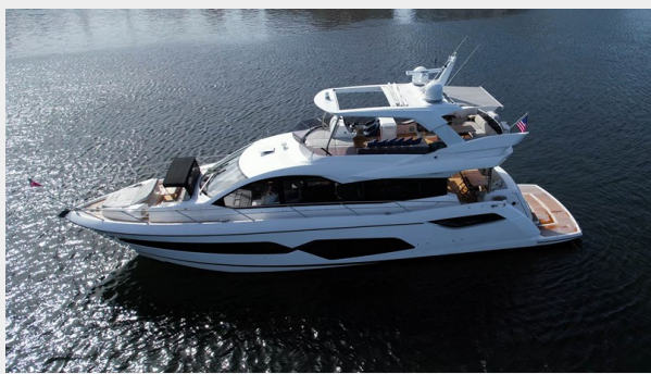
68_ Sunseeker (29)