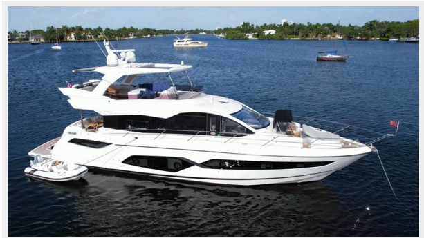
68_ Sunseeker (28)