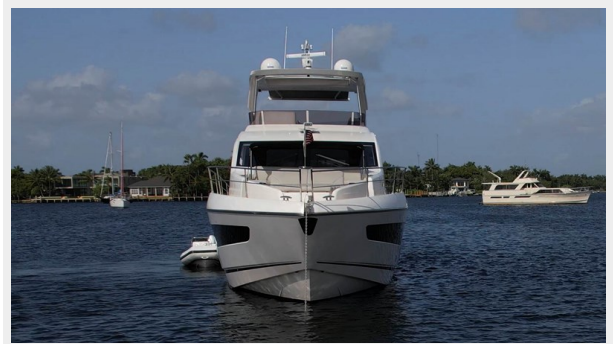
68_ Sunseeker (30)