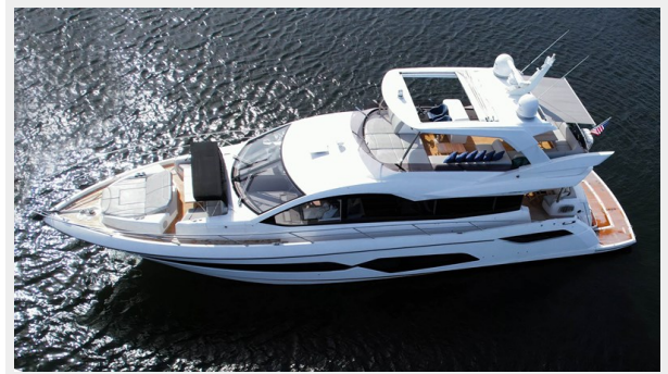
68_ Sunseeker (10)