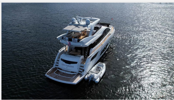
68_ Sunseeker (27)