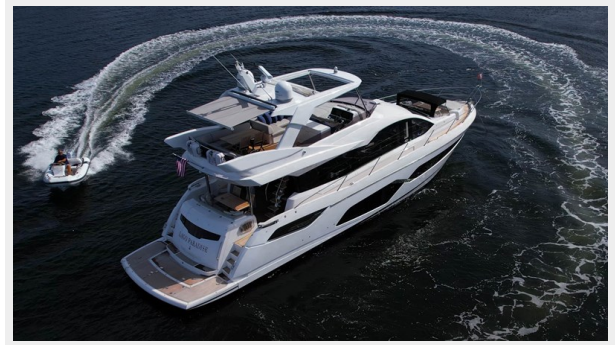
68_ Sunseeker (5)