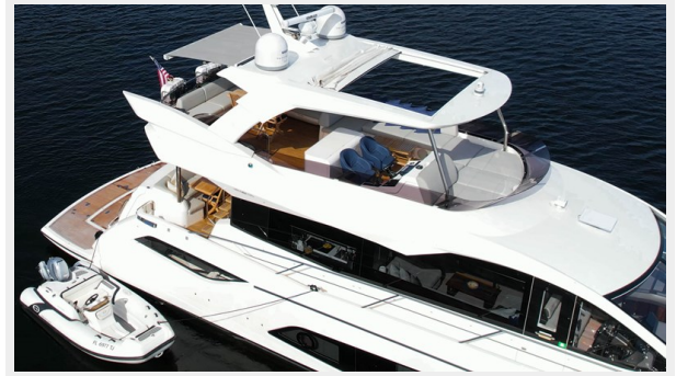
68_ Sunseeker (37)