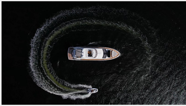
68_ Sunseeker (21.1) (2)