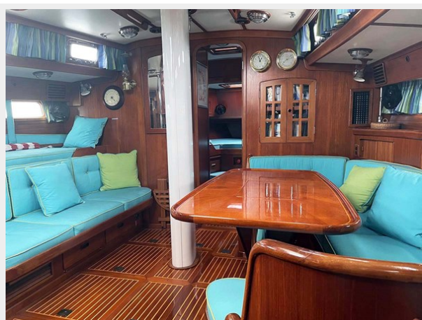
Main Salon, Fwd.