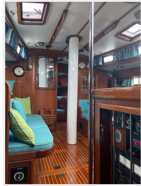
Port Salon, across from Nav