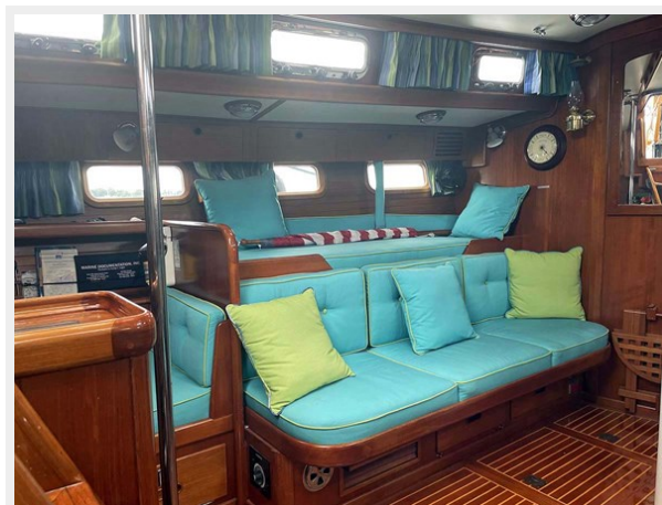
Main Salon, Port