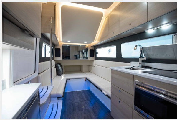
MY G Interiors Web Res-26