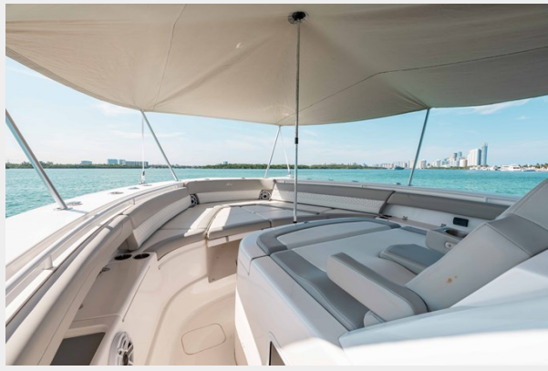
MY G Interiors Web Res-23