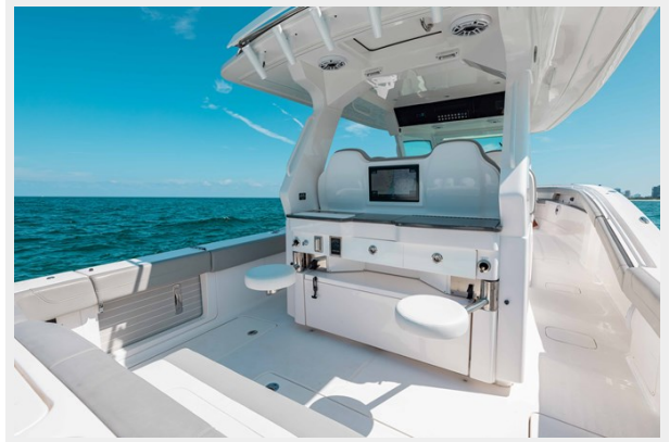
MY G Interiors Web Res-15