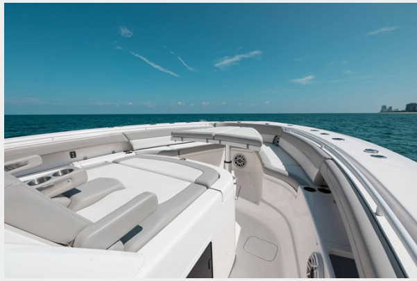
MY G Interiors Web Res-6