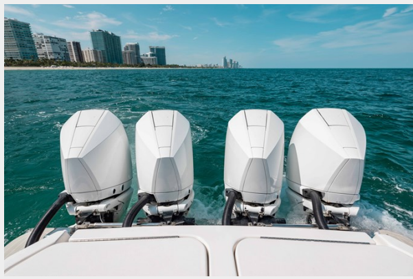
MY G Interiors Web Res-14