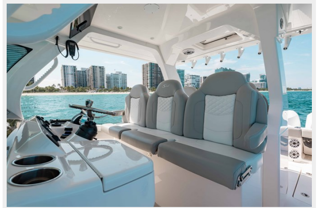
MY G Interiors Web Res-10