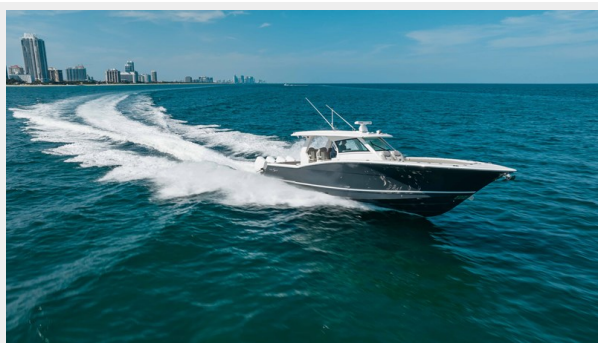
MY G Aerials Web Res-10