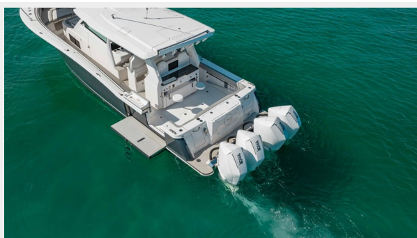
MY G Aerials Web Res-18