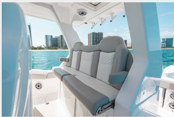
MY G Interiors Web Res-11