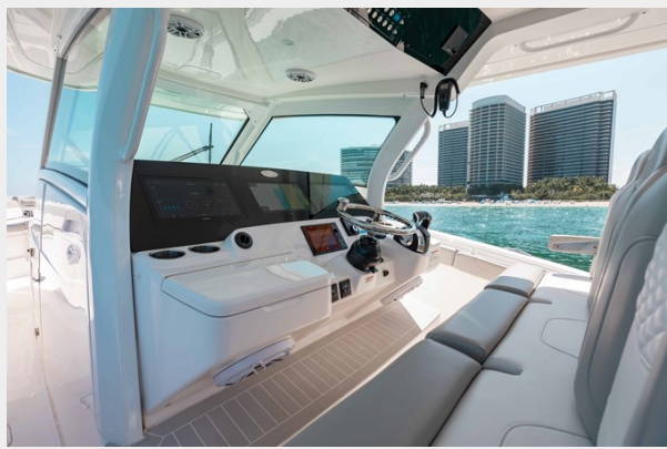
MY G Interiors Web Res-9