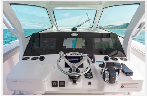
MY G Interiors Web Res-8