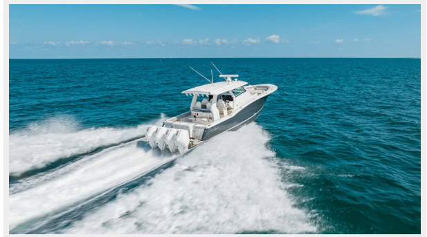
MY G Aerials Web Res-9