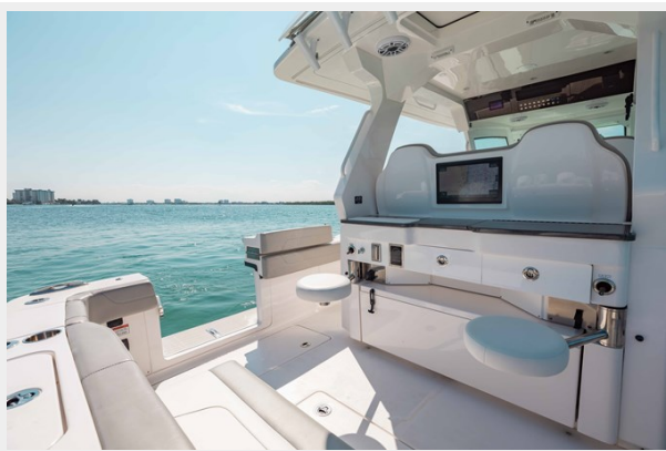
MY G Interiors Web Res-21