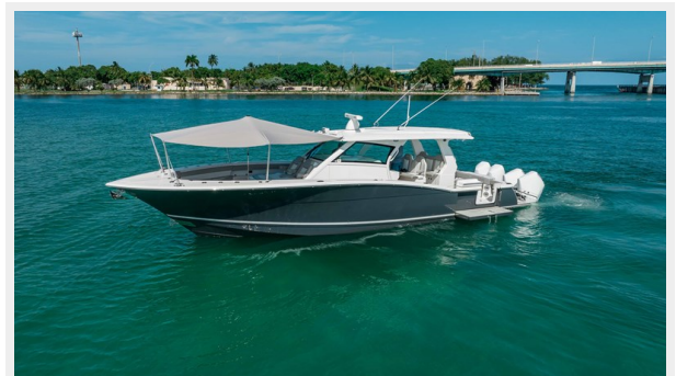
MY G Aerials Web Res-16