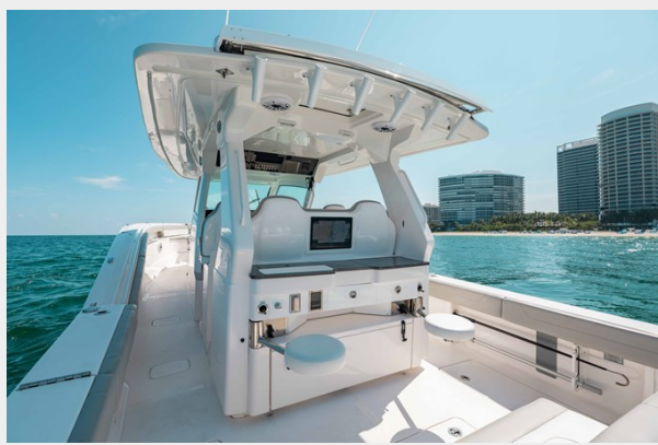
MY G Interiors Web Res-18