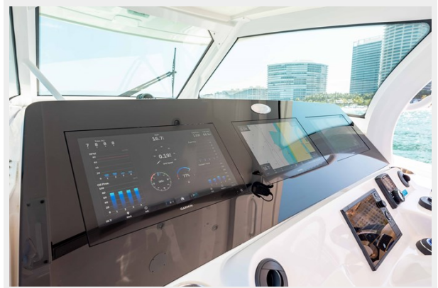
MY G Interiors Web Res-20